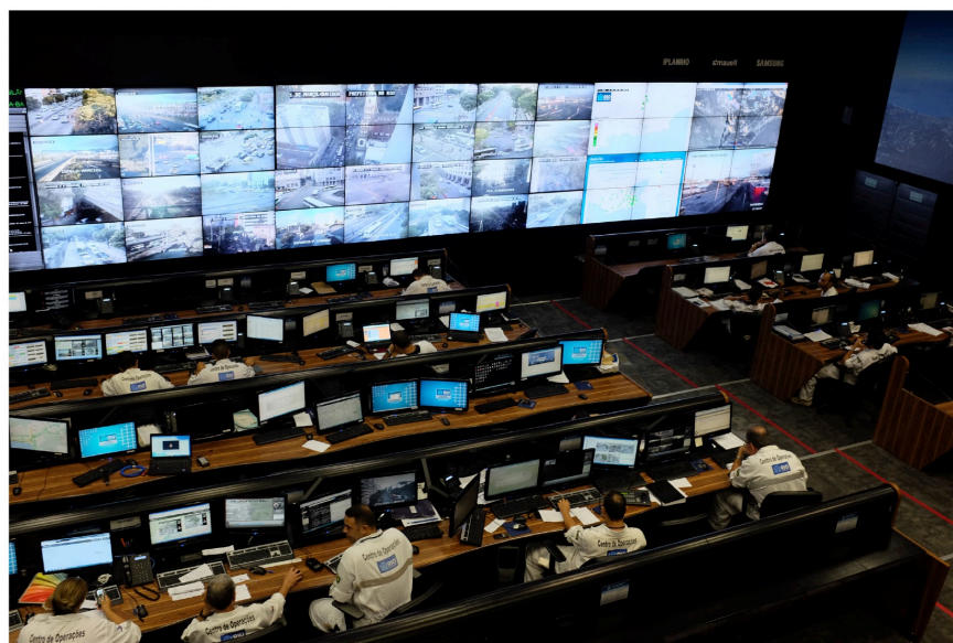
Figure 1: The COR's Control Room.

The empirical material, collected during April and May 2014, is the result of interviews with COR directives and other personnel working with public and private organisations involved in the centre's design and implementation, as well as site visits and TV broadcasts involving the COR. The focus is on the control room and the representation of the city that emerges through the interaction between the control room and the media, and therefore the methodological approach was not designed to capture the public's response to the claimed transformations in forms of urban governmentality. The paper is divided in four sections. Section 2 introduces notions of governmentality, opening possibilities for an understanding of the COR as an apparatus of security geared