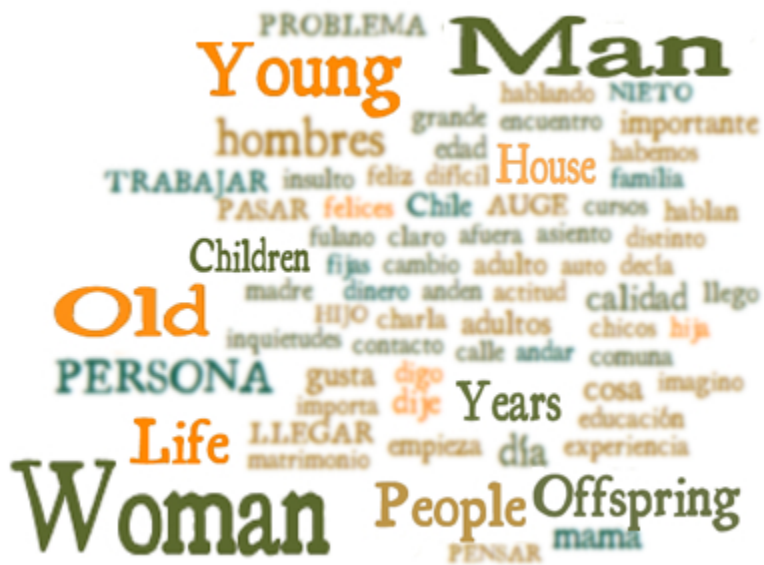
Figure 5 Social imaginaries of the older people domain