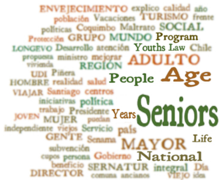
Figure 4 Social imaginaries of the mass media domain