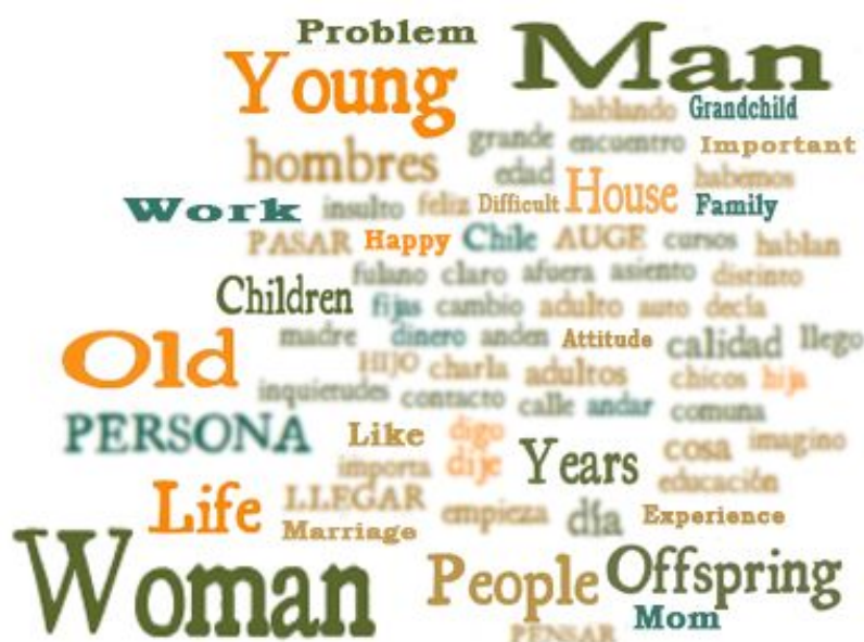
Figure 5 Social imaginaries of the older people domain

The word cloud reflects the centrality of gender in defining roles in later life. Intergenerational relationships are also highlighted, both in terms of family relationships, and by the prominence of old and young as defining the roles older people may or may not adopt in later life. Due to the variety of interests and preferences, words expressing specific motivations are not among the most frequent, but they are present nonetheless in the cloud (i.e. interests, working, liking, problem, happy, important). This word cloud diverges from the mass media and political domains in the absence of references to policies, but it does connect with the mass media in the centrality of intergenerational relationships.