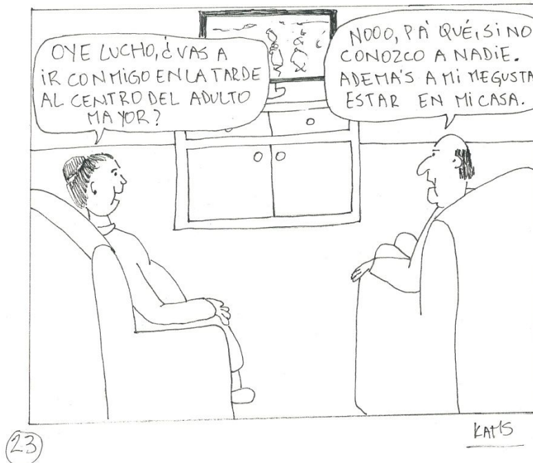
Figure 1 Example of cartoon style drawing