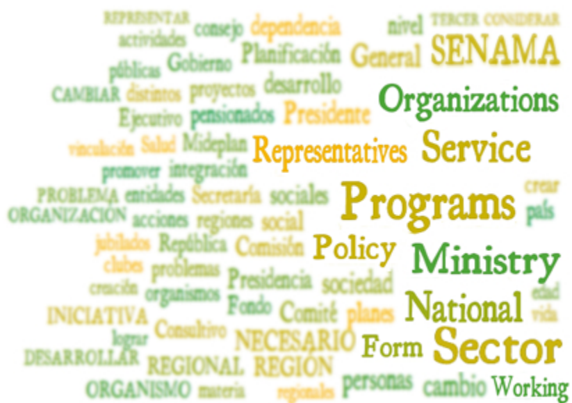
Figure 3 Social imaginaries of the political domain