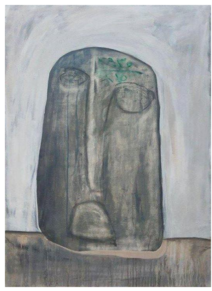
Fig. 1. Rihab Allawi, Deir ez-Zor, Architecture Student,