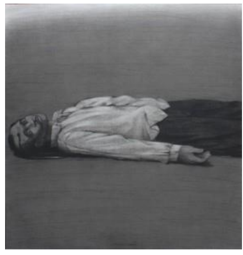
Fig 2. The Martyr of Daraa 1, 2013. Charcoal on