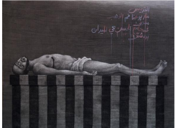
Fig. 3. Saint John Chrysostom is buried in

In another charcoal on paper drawing entitled Saint Chrysostom is buried in Damascus (2013), the dead body of Saint John Chrysostom - a Saint who lived in Antakia, Turkey in the fourth century and became archbishop of Constantinople - is lying flat on his back atop a wooden box with dark stripes (Figure 3). The Saint is naked except for a thin, white cloth around his midriff while his eyes stare blankly upwards and his open palms rest by his side. On his chest is a bullet wound and the blood from the wound is trickling onto the wooden box. In the right-hand corner of the drawing and atop the Saint's body are five lines of Arabic text which read: 'Saint Mar John Chrysostom lying in the Hassan mosque of the Midan quarter in Damascus.' The inscriptions themselves are written in blood and water.