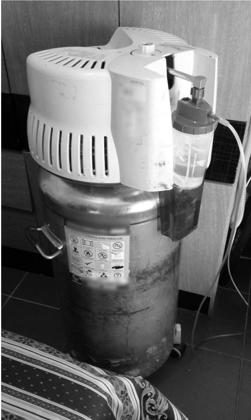
Figure 5: Liquid oxygen with docking station at the top for a portable tank.