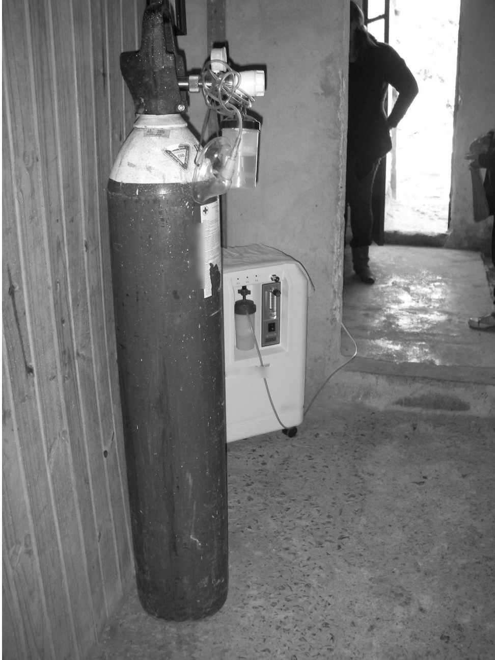
Figure 4: An oxygen cylinder.