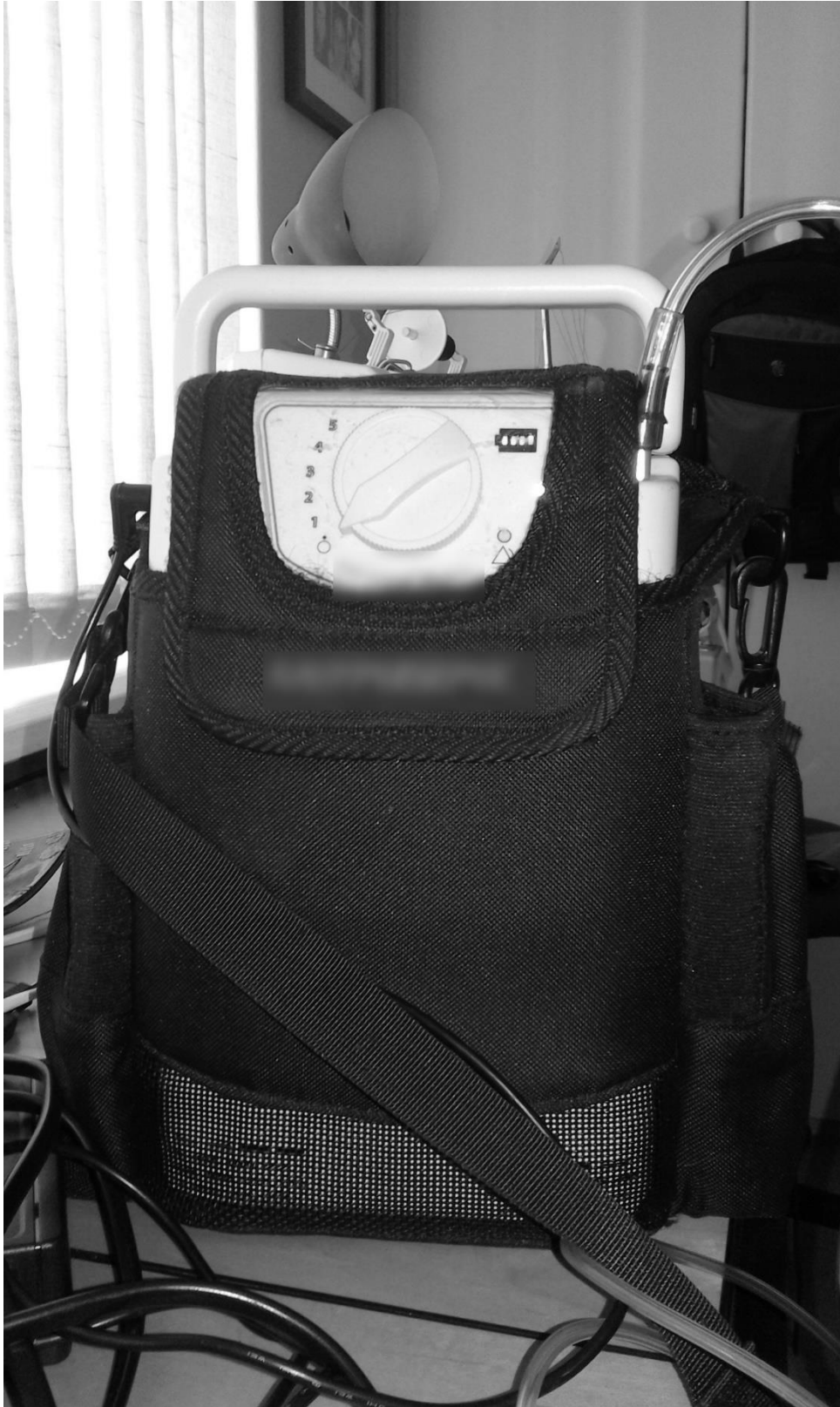
Figure 10: A portable oxygen concentrator in satchel-style carrying bag.