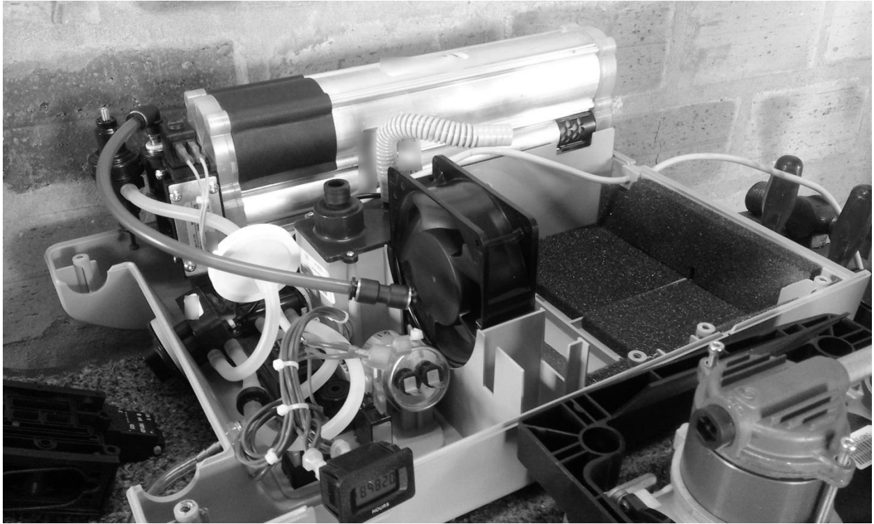
Figure 7: The inside of an oxygen concentrator. The clock counting running hours also visible.