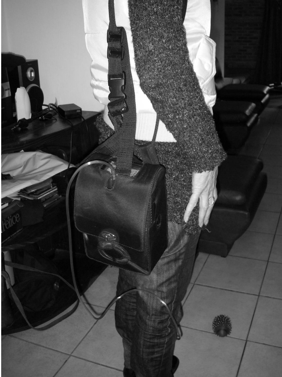
Figure 9: A portable oxygen concentrator in purse-style carrying bag.