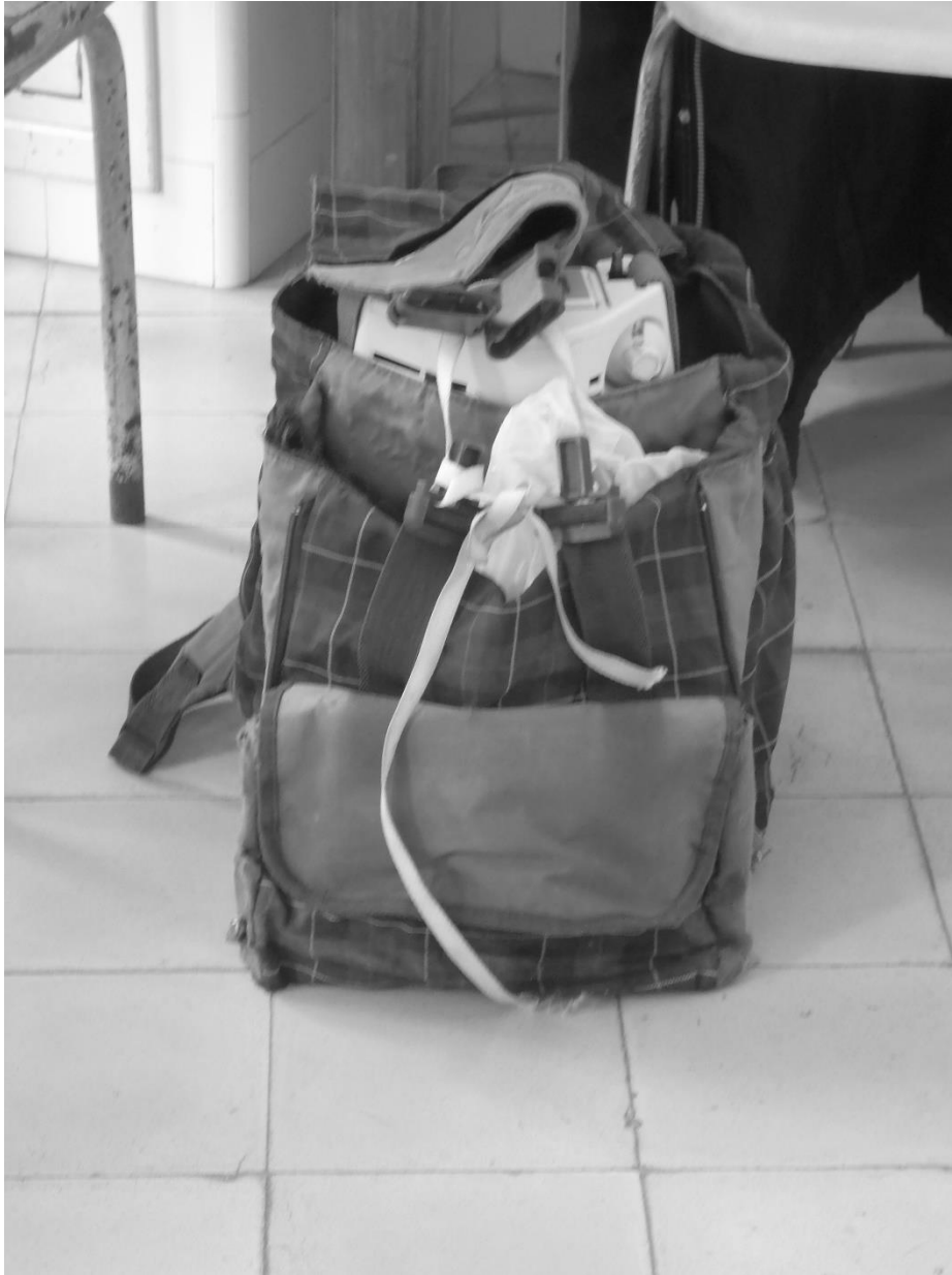
Figure 6: The portable liquid oxygen tank being carried in a participant's backpack.