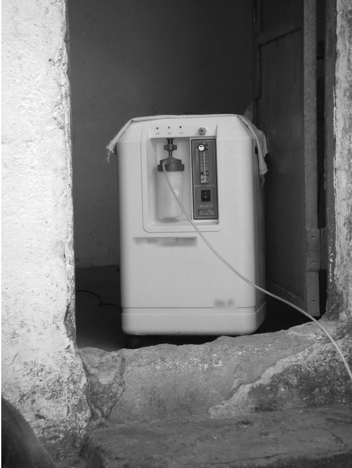
Figure 8: An electric stationary oxygen concentrator for home use.