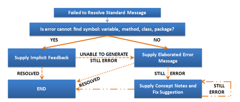
Fig. 1. Flow chart of the BlueFix process. Interventions are based on a student's error state.

From a HCI perspective, [9] suggests that in order to be most effective, compiler feedback should be divided into three increasing levels of elaboration: