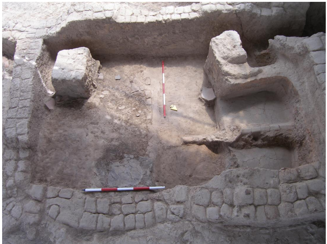
Figure 5. Detailed view of Transitional Chalcolithic kilns at Tepe Pardis. The kiln floors are visible on the right hand side, whilst broken pots are scattered across the floor.