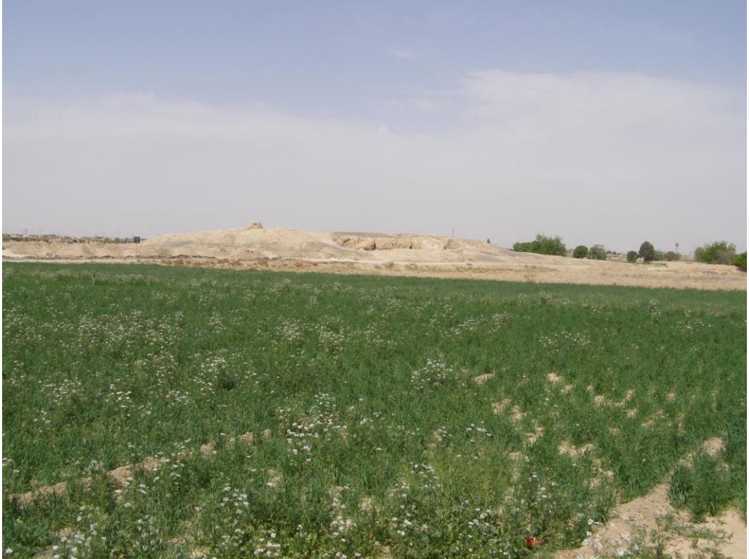
Figure 11. General view of the North Mound of Sialk