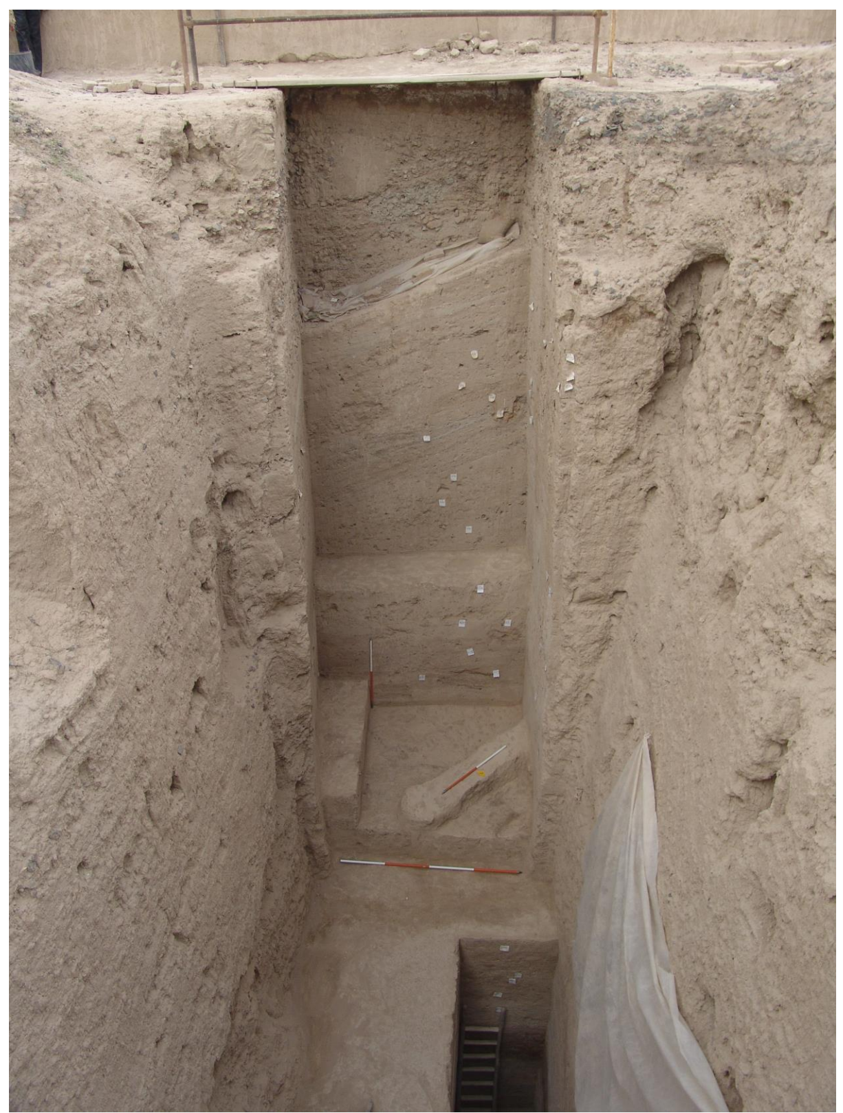
Figure 12. Detailed view of the excavations at the North Mound of Sialk, showing Trench Five cut into the section, and Trench Six cut into the floor of Ghirshman's old trench