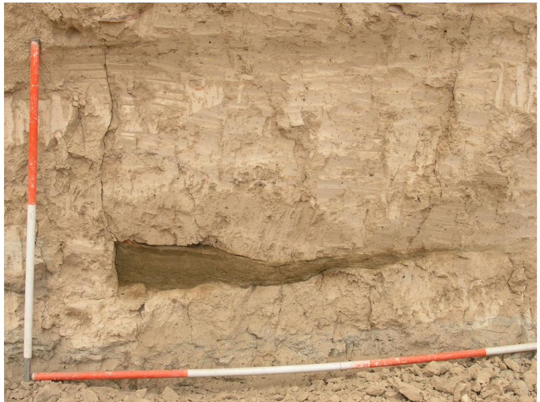
Figure 7. Detailed view of artificial water channel at Tepe Pardis. The triangualr profile indicates that it is not naturally occurring