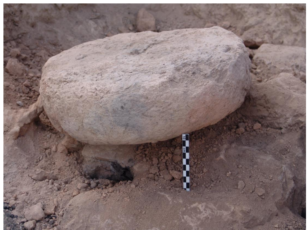
Figure 6. A terracotta slow wheel found at Tepe Pardis, the oldest known example in the world, dating to the fifth millennium BCE