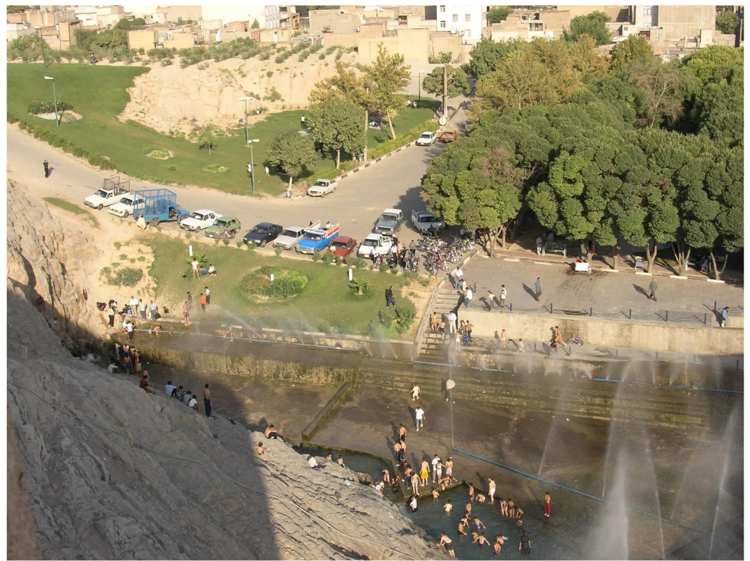
Figure 2. General view of the spring at Cheshmeh Ali, Reyy, now a public park