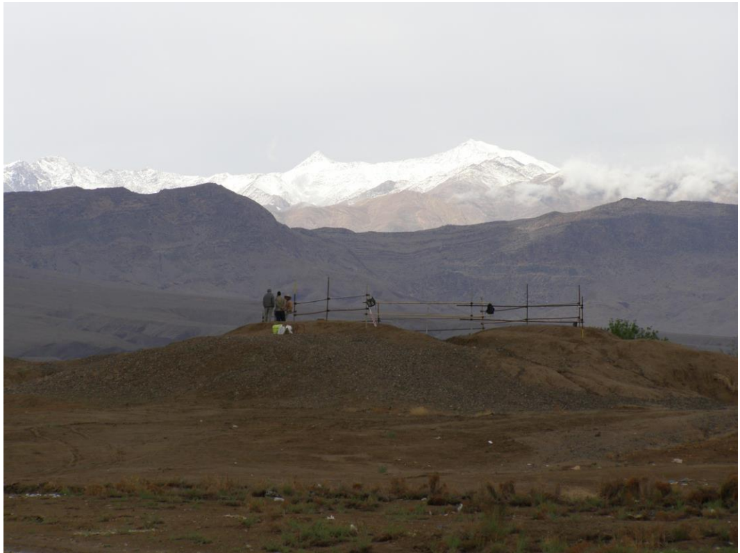
Figure 9. General view of the Karkas Mountains, with the excavations at Sialk in the foreground