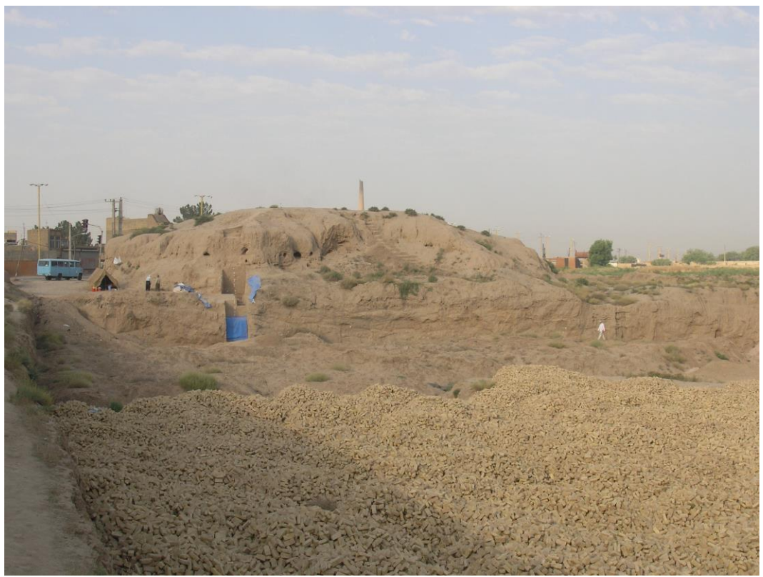
Figure 4. General view of Tepe Pardis showing the modern brick quarry in the foreground, and the step trench excavated into the cut away section of the tell

Figure 3. General view of palaeochannels visible in the section of a building site close to Mufinabad