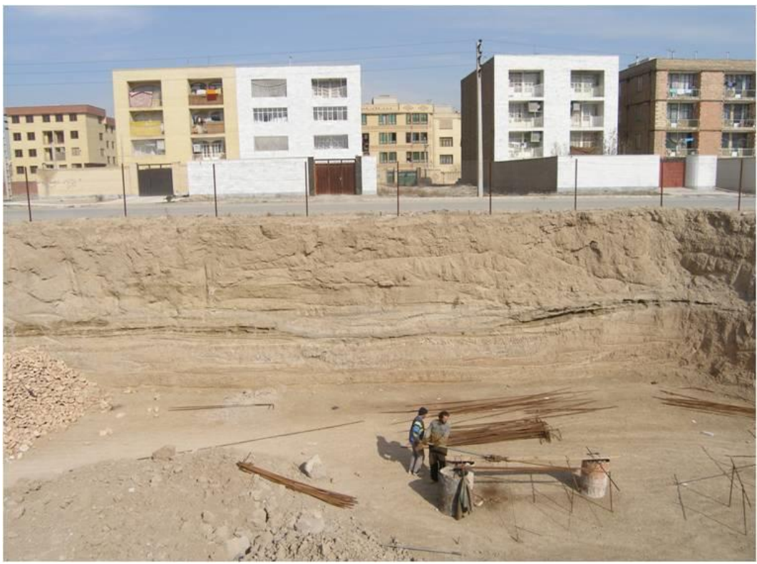
Figure 3. General view of palaeochannels visible in the section of a building site close to Mufinabad