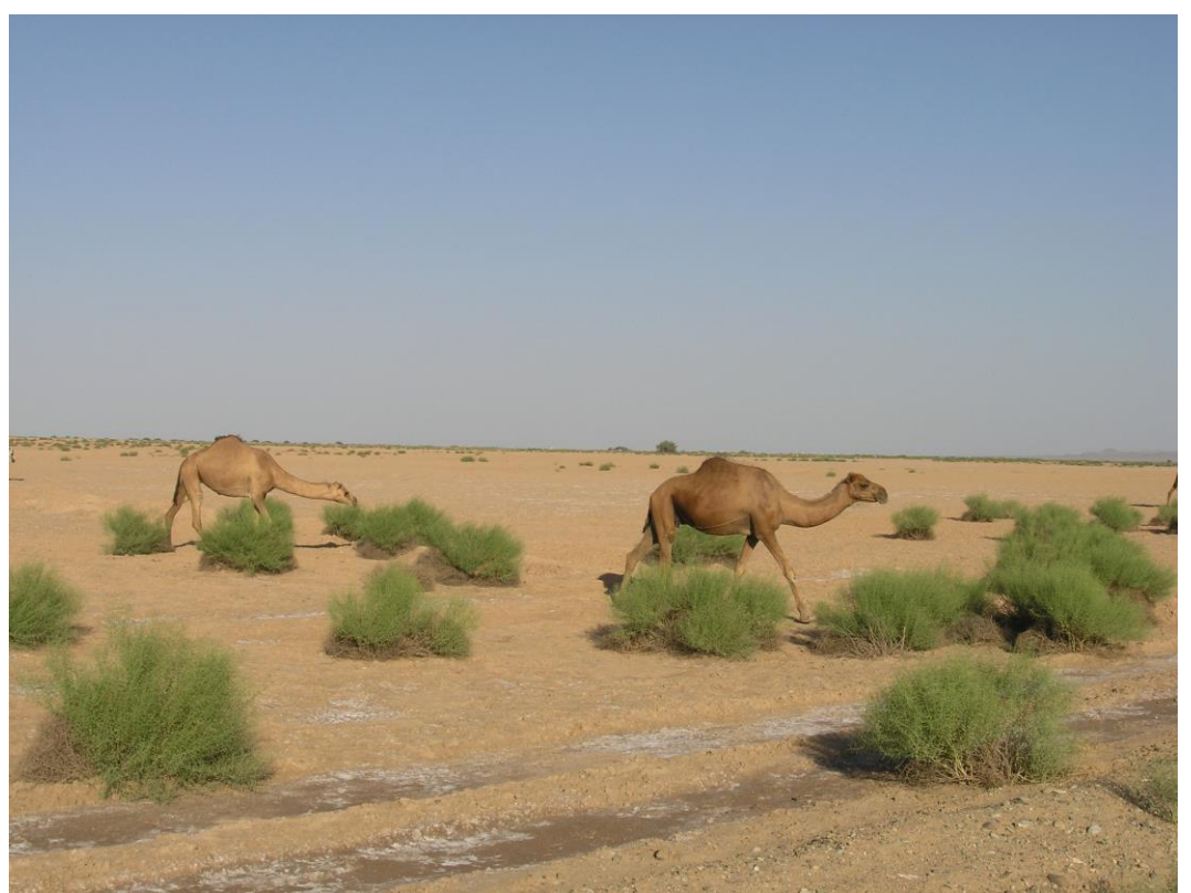
Figure 8. General view of desert to the south of the Tehran Plain