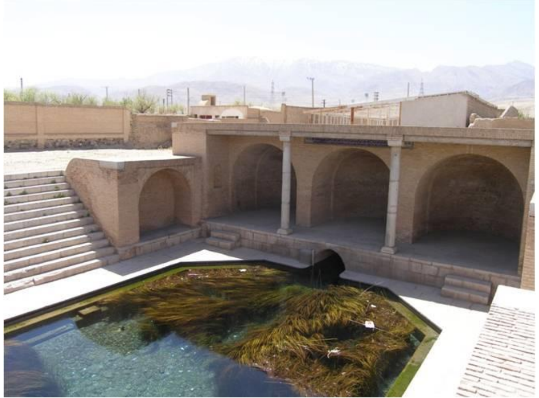
Figure 10. General view of the qanat mouth at Bagh-e-Fin, Kashan. The water supplies the former royal pleasure gardens