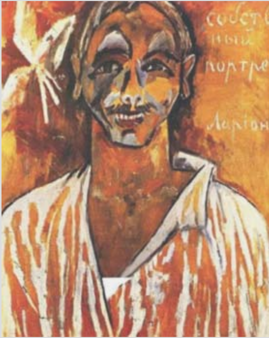
5 • M. Larionov, Self Portrait , 1912 Ex-Tomalina-Larionova Collection, Paris