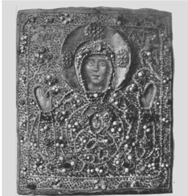
2 • Mother of God of the Sign, 17 th -18 th centuries In, Peasant Art in Russia, London, The Studio, 1912

Conventionally translated as “texture”, the Russian term faktura really references the unique surface qualities of the art work created by the way in which the artist expressively works the medium and materials from which the painting or sculpture is made. In many of his writings Larionov addresses faktura and