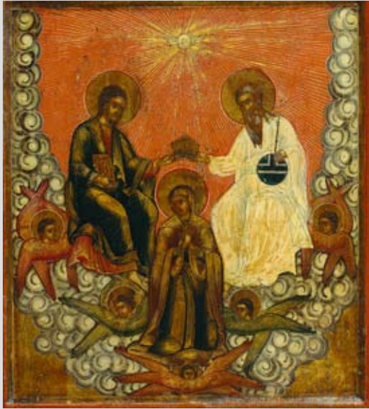
3 • Coronation of the Virgin, North Russia, 1860s