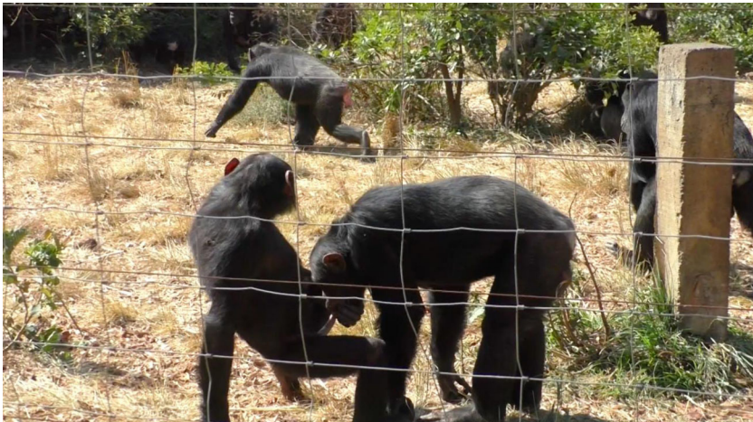
Figure 5. [02:10] Max has moved his hand to David's chin and makes gentle thrusts with his hips, moving his penis slightly in and out of David's mouth.

During several months prior to this interaction, Max made other unaccepted sexual invitations following dyadic conflicts where he expressed victim behaviour. On two occasions Max presented his penis towards uninvolved bystanders including on 27 April towards his adult sister Maxine, and on May 7 towards Zsabu. On these occasions, Max made a concave