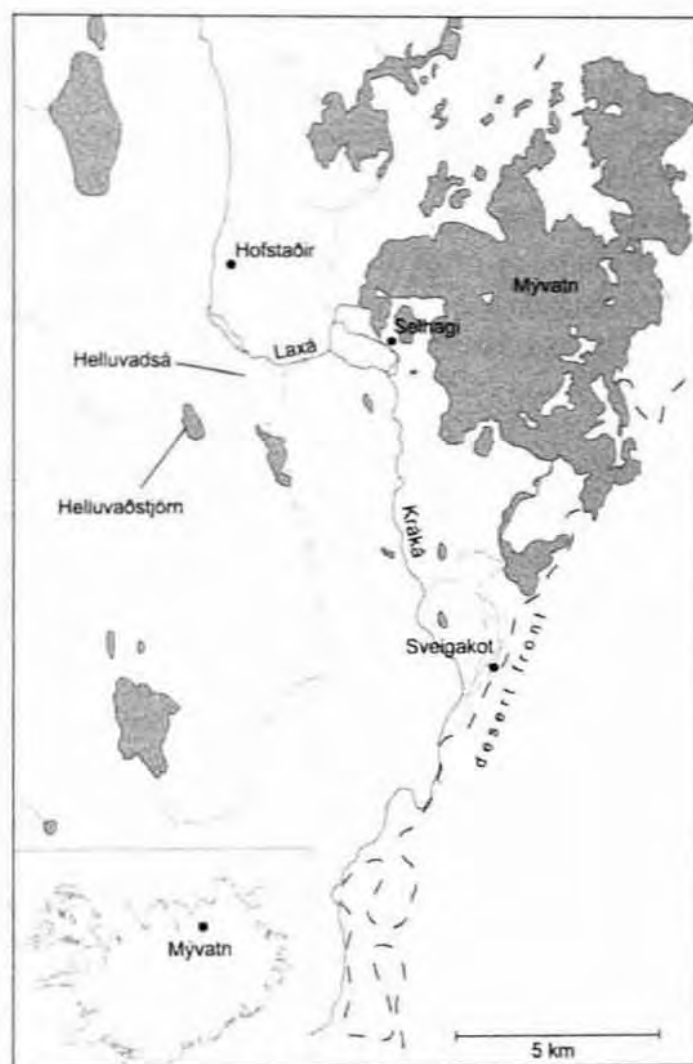
Fig. 1. Location map showing Mývatnssveit, with Lake Mývatn and other sites mentioned in the text. The current position of the desert front is also shown.

Zooarchaeological studies are currently being carried out at several Norse and early medieval farm sites in the Mývatnssveit district of northern Iceland (Fig. 1). All of the midden deposits investigated so far have contained the remains of several species of fish, including at least two freshwater species, brown trout ( Salmo trutta ) and arctic charr ( Salvelinus alpinus ), as well as varying quantities of marine taxa. The data indicate substantial differences in the importance of freshwater fish to the Norse and early medieval economy from one site to the next and over time. One possible environmental explanation for the temporal changes in the archaeofaunal record is that fish consumption varied according to the size of fish populations, which must ultimately have been determined at least in part by factors such as food availability and habitat quality. It is well established that the colonization of Iceland by the Norse brought large-scale change in terrestrial environments, with widespread deforestation (e.g. Hallsdóttir 1987) and soil erosion (e.g. Simpson et al. 2004). Could the Norse have wrought similarly profound changes on aquatic ecosystems? Here we review the functioning of the Mývatnssveit freshwater ecosystem and explore the evidence for pre-modern anthropogenic change.