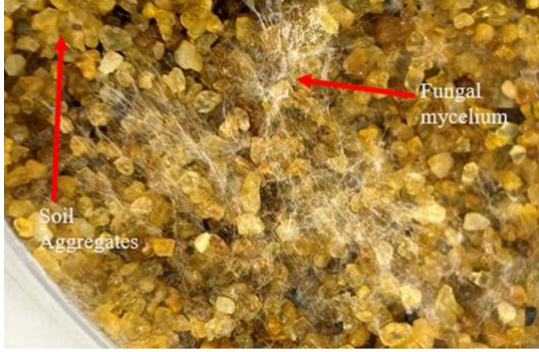
Figure. 2. Fungi mycelium growing in soil

It was interesting to note that the samples amended with 1.5% biopolymer exhibited a better growth compared to those with 2.5% biopolymer. This suggests that an optimal biopolymer concentration exists for promoting fungal proliferation, beyond which growth is inhibited. Excessive biopolymer concentration might have created an overly viscous environment, potentially impeding hyphal extension and nutrient diffusion. This aligns with findings by Harris et al. (2006), who observed that soil physical properties, including viscosity, significantly influence fungal growth dynamics. Also, Salifu (2019) noted that biopolymer formed a sticky hydrogel cohering soil particles together and holding moisture in the soil, making it challenging for the mycelium to proliferate. Moreover, in samples amended with higher biopolymer content, clustered and localised growth was observed. It is believed that abundant nutrition source reduces the need for extensive foraging. Instead of hyphae spreading out to gather nutrients, the growth concentrates in nutrient-rich areas, which might explain the denser, localized mycelial growth as experimentally observed.