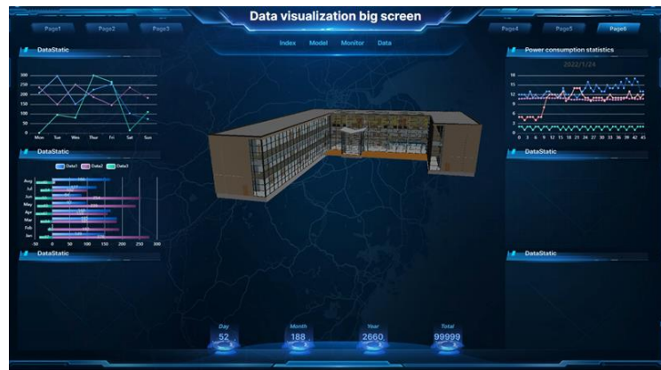
Fig. 6: Virtual Layer Interface.

of the developer tool, which means that there is a performance bottleneck during JavaScript execution. The functions take a long time to execute and consume a lot of resources, causing the main thread to block, which in turn affects the page's responsiveness and the user's interactive experience. Although there are some flaws in the development results, in general, the performance of the virtual layer and data layer of this development is good, and it can be seen as a successful case implementation.