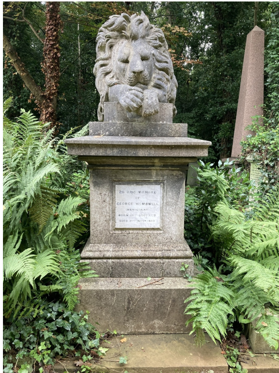
FIGURE 5 Nero the Lion. [Colour figure can be viewed at wileyonlinelibrary.com ]