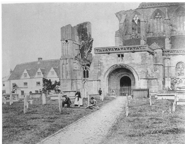
FIGURE 3 Painting Gravestones.