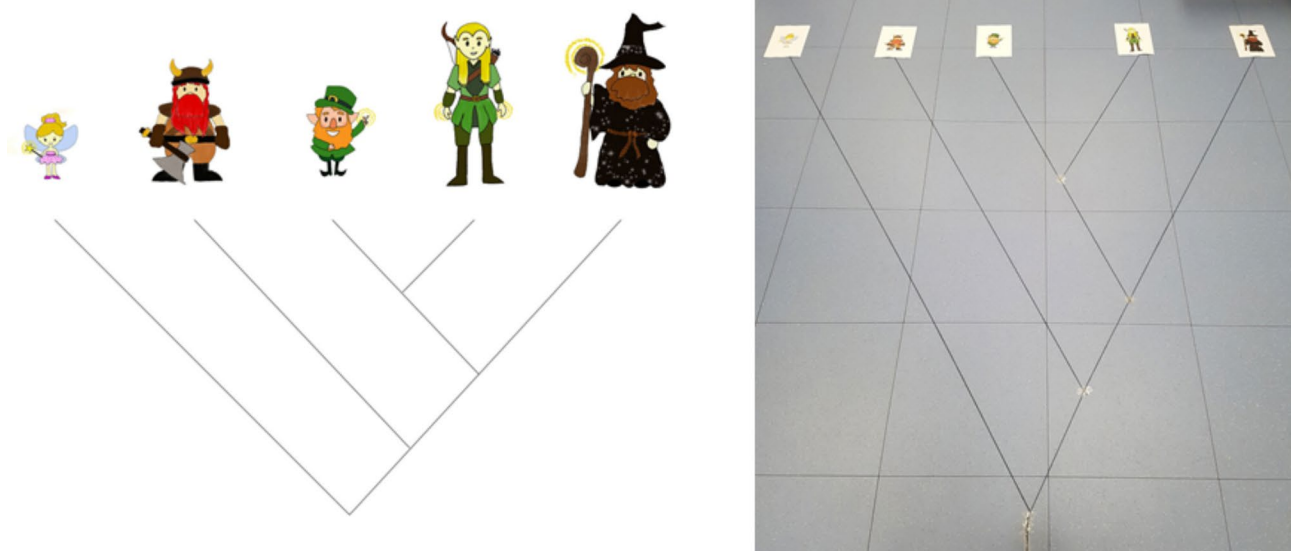
Fig. 1 Experimental phylogenetic tree. Left panel shows the phylogenetic tree printed and provided in the visual condition; Right panel is a photo of the experimental kinaesthetic and multisensory floor set up. All text descriptions available in supplementary material 3

Participants were randomly assigned to one of three conditions. If in the visual condition, the participant remained seated and was given the phylogenetic tree