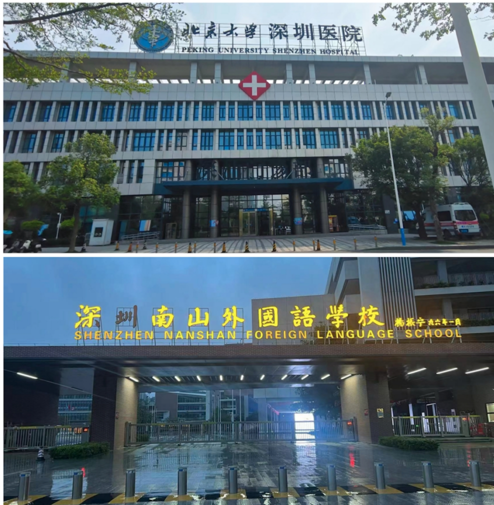
Figure 2. Shenzhen facilities and landscapes in SSCZ (top: Peking University Shenzhen Hospital; bottom: Shenzhen Nanshan Foreign Language School)