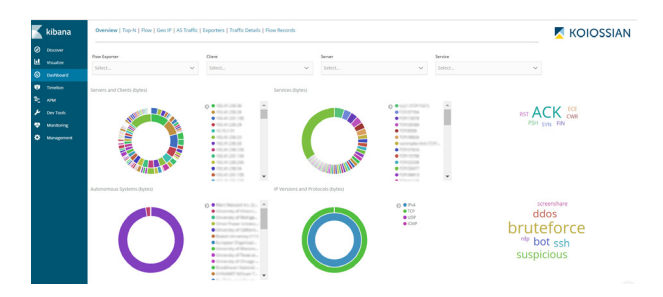
Figure 2. Example of the main Elastiflow Kibana page at AGLT2.

The configuration of the SOC at Michigan relies upon a local Elasticsearch cluster, originally dedicated to capturing system and device logging. While the integration between this Elasticsearch cluster and Bro is not yet completed, having Elasticsearch made it very simple to incorporate add ons. In addition to Bro monitoring, we wanted to have better visibility into our network traffic. To provide this visibility we installed ElastiFlow [10]. Elastiflow enables Netflow/IPFIX records to be incorporated with Elasticsearch and provides a very nice set of Kibana dashboards to visualise and track the flow data. We had some challenges getting the sflow-codec and the Kibana elastiflow index imported and ended up just "learning" the ElastiFlow index from the incoming data. One example of how to install and configure ElastiFlow is shown in [14]. Once Elastiflow was setup we just needed to configure our Juniper router to send sflow records to it. Shown in figure 2 is an example of a typical ElastiFlow dashboard.