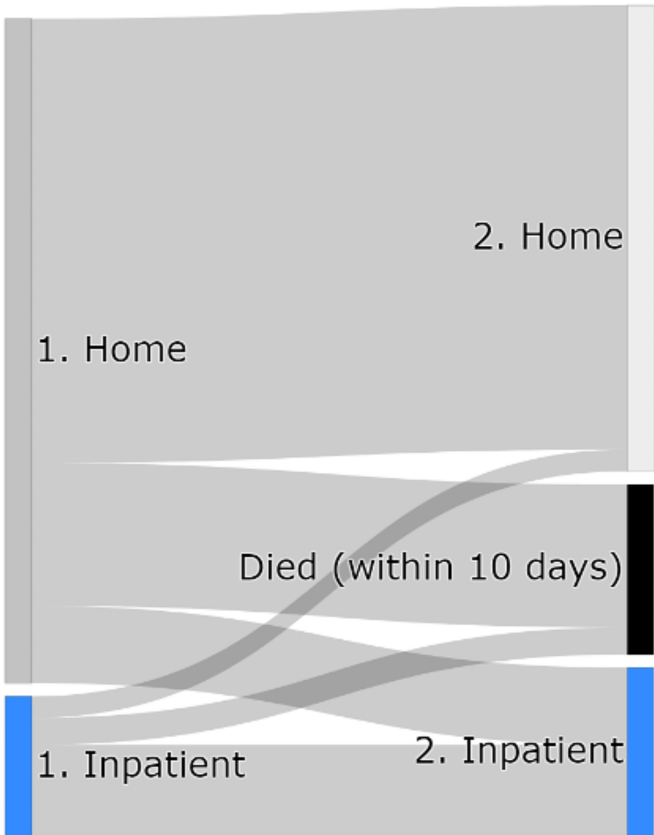
Fig. 3 Sankey diagram demonstrating flow between states before and after a resident's first COVID-19 positive test