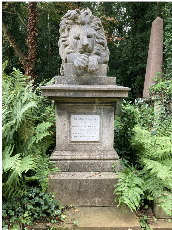
FIGURE 5 Nero the Lion.