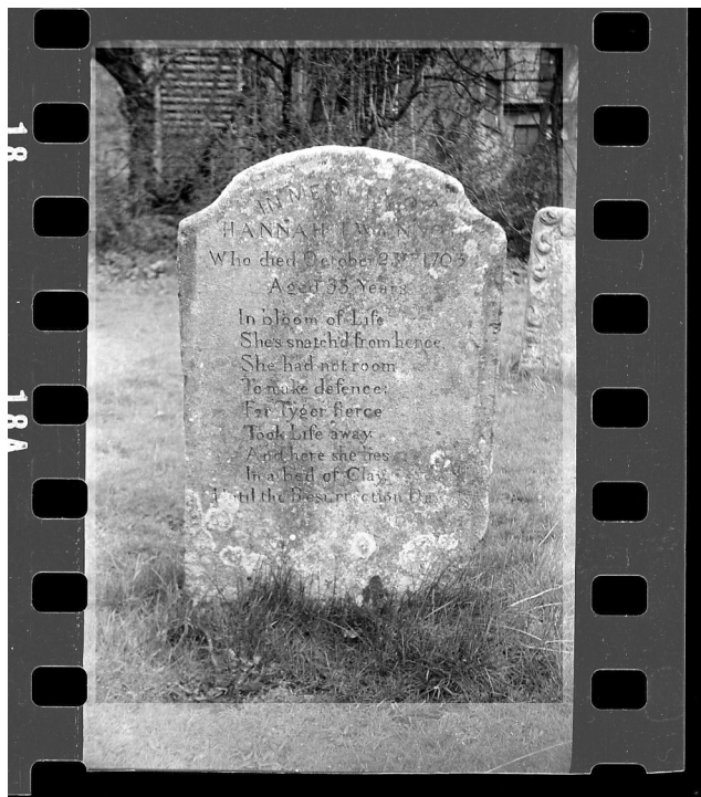
FIGURE 2 Hannah’s Gravestone 1966.

David Forward provided me with a pair of Victorian photographs. One shows the right-hand side of the Abbey graveyard (viewed looking towards the Abbey’s front), where Hannah’s gravestone is today. Most of the graves in the photograph are not present today, but Hannah’s grave, present on that side today, does not appear in the photograph. The vast majority of ‘the past’ has disappeared (slate cracks and sandstone crumbles). What has not disappeared is potentially just as problematic. The second photograph presents the left-hand side of the graveyard (see Figure 3: Painting Gravestones). It shows two figures sat repainting gravestones. Most physical artefacts do not last, and those that do last do so because they have been altered (in content and/or location).