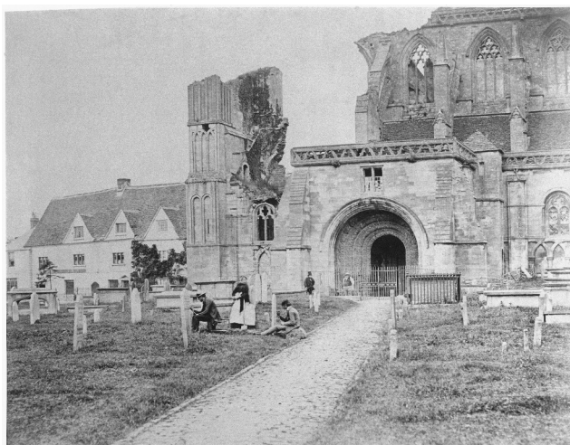
FIGURE 3 Painting Gravestones.