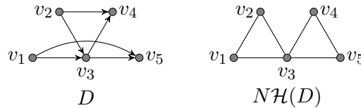
Figure 2. A niche hypergraph containing two copies of K_3 .

Note that Theorem 15 does not imply that K_n is a forbidden subgraph for niche hypergraphs (see Figure 2).