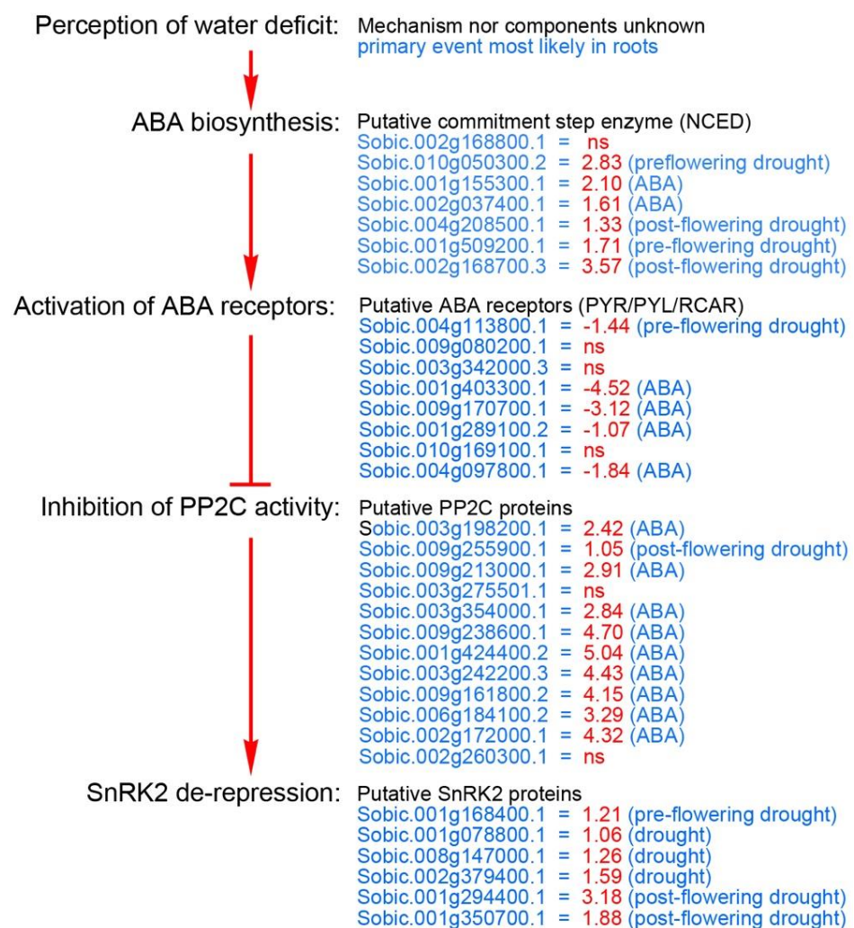
Figure 3. Transcriptomic responses of the putative sorghum ABA signaling module. Arabidopsis proteins were used with BLAST to search the Phytozome database for sorghum orthologs of (i) the commitment enzyme in the ABA biosynthesis pathway, (ii) the ABA receptor proteins—pyrabactin resistance (PYR)/PYR1-like (PYL)/regulatory component of ABA receptor (RCAR), (iii) the protein phosphatase 2C (PP2C) proteins, and (iv) the sucrose non-fermenting-1 (SNF1)-related protein kinase 2 (SnRK2). The response of each gene to drought or ABA was searched in the Genevestigator database [124] and the log 2 ratio of treatment/control is provided in red font. The gene response data captured is from two field drought studies [19,74] and one laboratory-based ABA study [88]. Activation is denoted by a line with arrowhead, while protein inhibition is denoted by line ending with a T-junction. NCED, 9- cis -epoxycarotenoid dioxygenase; ns, no significant response.

data from Genevestigator ( https://genevestigator.com/ , accessed on 8 July 2021) [124] or similar databases. Figure 3 presents an example of such an exercise showing the response of sorghum orthologs of the ABA signaling genes, together with the enzyme catalyzing the commitment step in the biosynthesis of ABA. The transcriptomic results show activation of ABA biosynthesis, suppression of ABA receptor protein genes, and activation of PP2C and SnRK2 kinase genes. Suppression of ABA receptor genes possibly indicates transcriptional signal termination after PP2C inhibition has been achieved, while up-regulation of PP2C transcription could be a mechanism to re-establish normal homeostasis after SnRK2 activation has been completed. Analyses such as this one could provide useful hypotheses that can be tested using specific target genes for validation. A similar approach can be used to target different aspects of sorghum drought stress adaptation, such as biosynthesis of osmoprotectants.