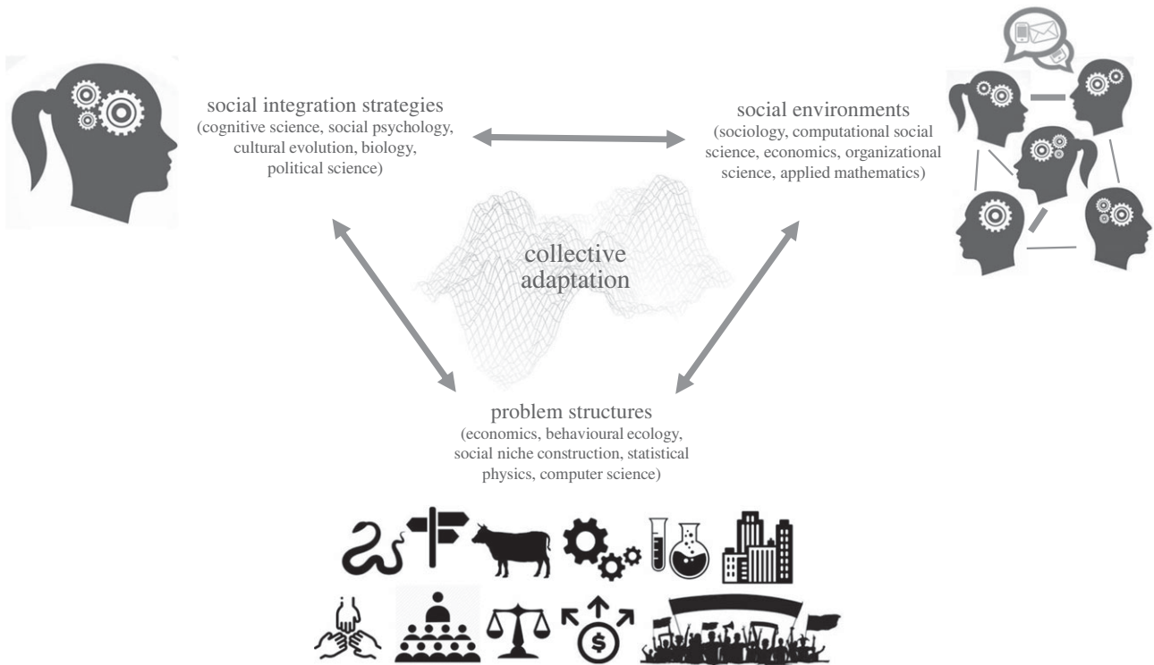
Figure 1. Collective adaptation can be seen as an emergent property of a complex socio-cognitive system driven by dynamic interactions of social integration strategies, social environments and problem structures collectives face. Collectives take different trajectories when navigating the complex adaptive landscape of these interactions. The system components are wholly entangled, but each has been studied in relatively isolated disciplines, and extant models of collective dynamics rarely include all components. Combining relevant findings and methods in different disciplines (box 1) is critical for understanding collective adaptation, avoiding parallel efforts (box 2) and building quantitative models that enable answering important outstanding theoretical and practical questions about human sociality.