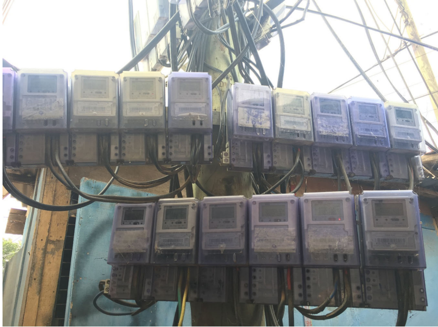
Figure 4. 'One-one' meters.