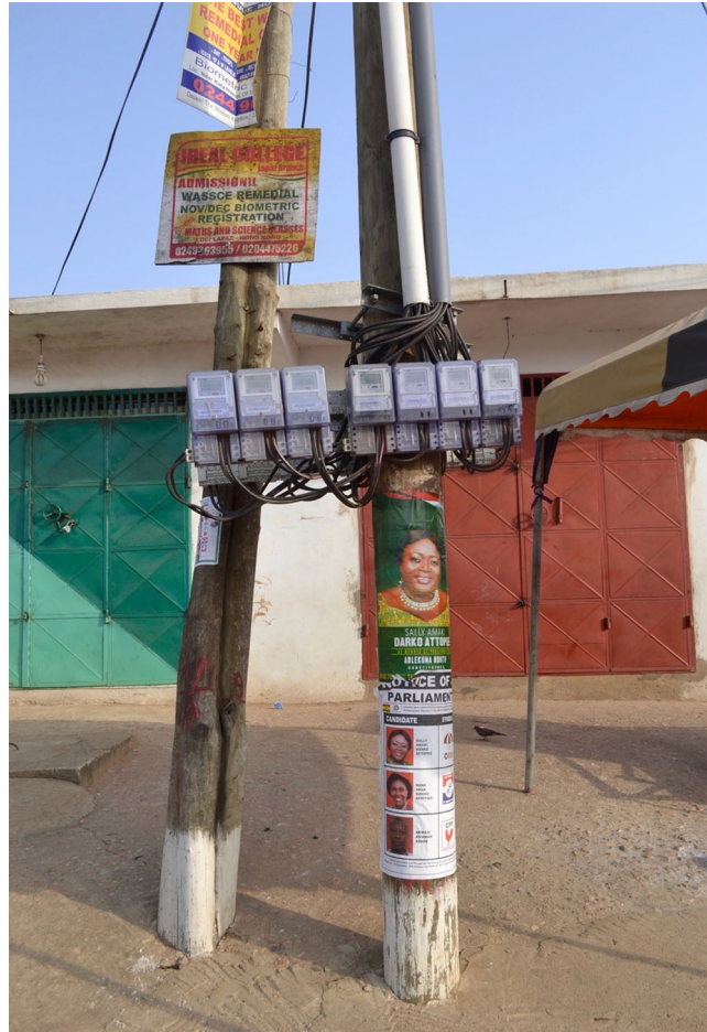
Figure 5. 'Pole' prepaid meters and election campaign.

difficult decisions involved in 'contracting' an illegal connection (Degani 2017: 302), and to the frequent complicity of ECG staff themselves.