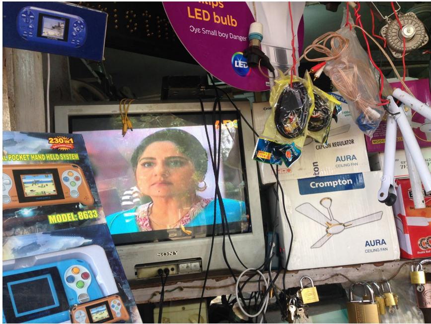
Figure 1. Kumkum Bhagya on TV in an electronics shop.

the vulnerabilities of living through the demands and struggles of others. This makes electricity a highly contentious public good, prone to widespread suspicions and resentments. As tenants depend on their neighbours' ability to pay for the increasingly elevated cost of electricity bills, they find themselves in a situation of precarity that is caused not so much by perennial difficulties of access or reliability, but by the socioeconomic relations of dependence and obligation generated by the shared electricity meter. While this is quite a unique feature of the electricity network in Accra, in part caused by the particularity and prevalence of compound housing, I want to suggest that it also reveals a more general aspect of infrastructure as the systems of connection undergirding and mediating collective life.