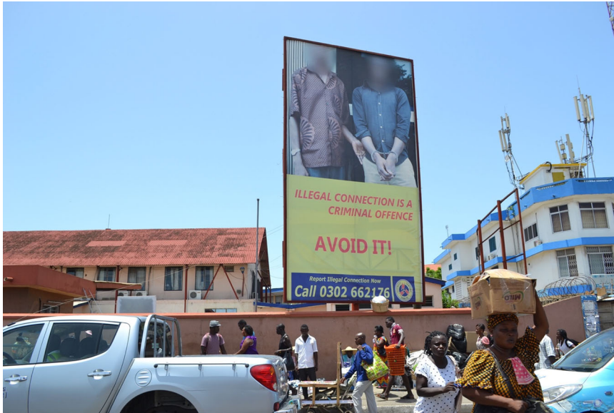
Figure 6. Placard warning customers against illegal connections, outside ECG's central office.

presupposed, and publicly indicated, the perceived untrustworthiness and immorality of particular users. As Freddy B. revealingly explained: