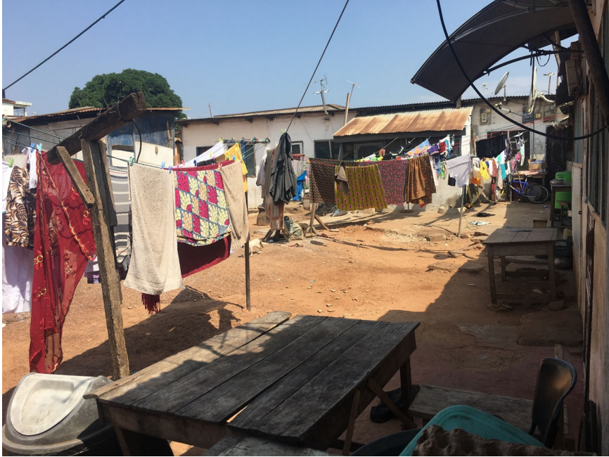
Figure 2. Auntie Habibah's compound house. In the background of the picture, we can see the individual meters affixed to the walls of individual entrances.

In what follows, I collect these electricity stories into three main scenarios: (1) The Landlord Cheat , and tenants' efforts to acquire their own meters through backdoor routes; (2) The AC Hideaway , or suspicions about tenants' use of high-consuming electrical items in their room, and the elaborate 'gadget-points system' devised by tenants to share the bill fairly; and, finally, (3) No Money, Pay By Force , the most dreadful of scenarios, in which tenants are unable to contribute to the shared bill and risk humiliation or debts.