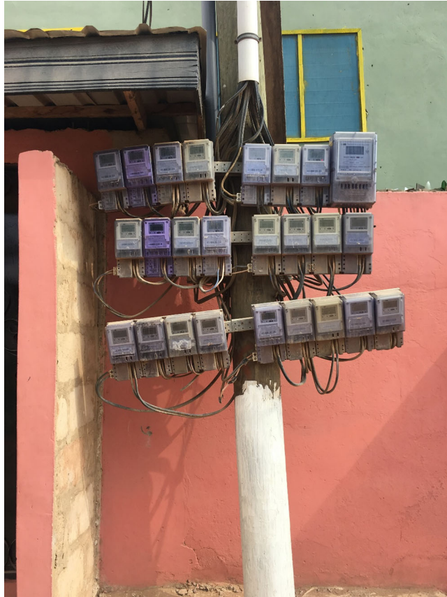
Figure 7. Living one-one together, through meters.

bypass routes. Rather, the nosiness of neighbours – motivated by envy, curiosity, or indeed malevolence – provided a most effective deterrent to any resident concerned with their own self-respect. ‘Neighbours are like CNN’, a friend joked: ‘They come to your house with their mouth, see what’s happening, and broadcast it everywhere!’ ECG was well aware of these local ‘broadcasters’, and rightly envisioned that public meters would provide an effective social surveillance system, to which the technical features of the meters appeared secondary, if not redundant.