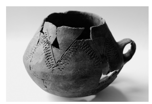
Figure 4.2. Decorated jar from Grotta Nisco (Museo Nazionale Archeologico, Altamura).

of deer, dog, fox and shark; copper rings; carved bone pins with decorated heads; and grooved bone toggles. A rare finely decorated bossed bone plaque, probably carved from the long bone of a sheep or goat, was also found close to a body in a rock-cut tomb at Casal Sabini near Altamura in central Puglia (Figure 4.1). It exhibits close stylistic similarities to other examples from southern Puglia, Sicily, Malta, Greece and Turkey. These objects may have been exchanged over long distances, perhaps having been originally manufactured by members of the Castelluccio culture in South-East Sicily (Holloway 1981: 11-20; Setti and Zanini 1996), and at least would have evoked distant stylistic connections. An indirect indication of the growing cultural significance of these ornaments might also be provided by the predominant style of decoration seen on contemporary fineware in South-East Italy, which changes from Neolithic geometric motifs painted over the surface of light figulina ware and comparable to textile patterns, to Copper Age incised lines, impressed points and raised studs arranged in a more restrained fashion on dark burnished ware, particularly around the upper body of vessels, like necklaces (Figure 4.2).