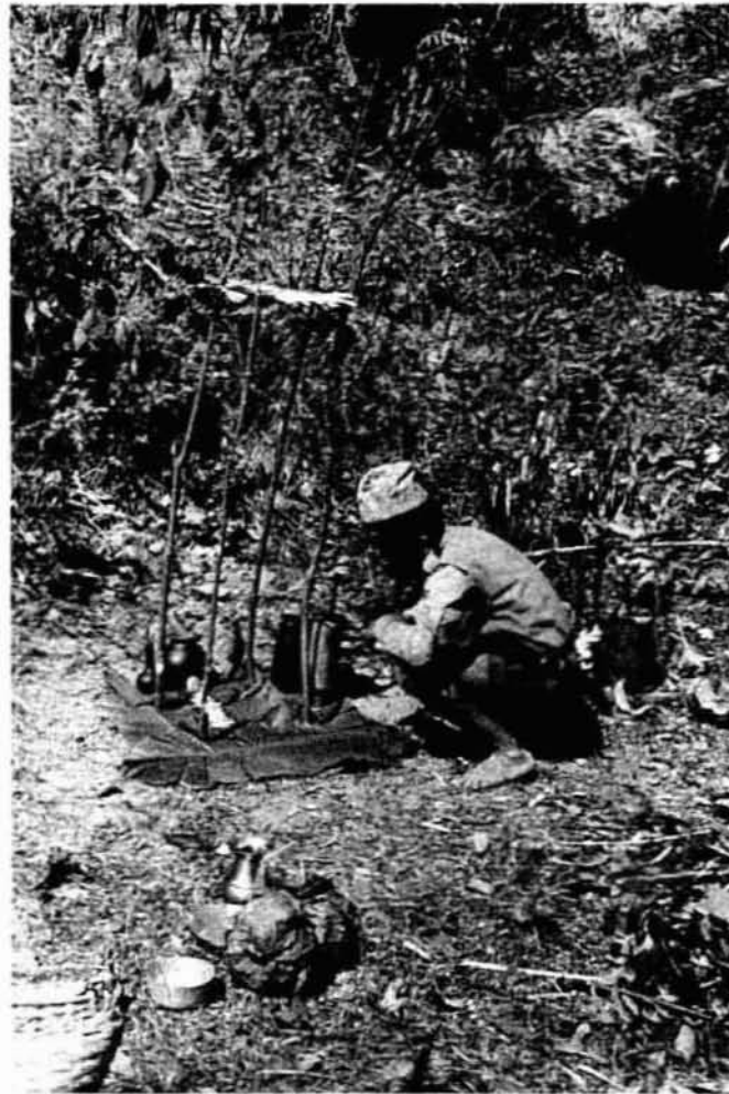
Figure 7.2. Shrine for Pappamama'chi.