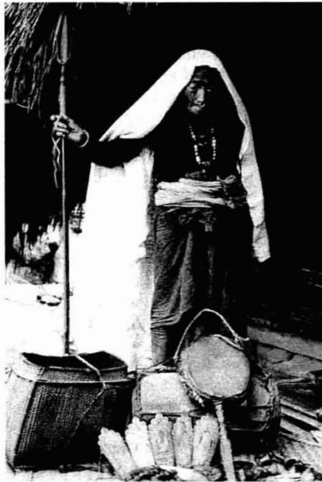
Figure 7.1. The mangmani of Pangma village.

Once it was all free, and as people claimed it they named it: that green grass also has samek . It is owned. Everything had a samek , making it a separate kind; fire has samek , door has samek ; we call maize lingkhama , rice we call rungkhama and millet wekhama ; money is pekham , bamboo is yangli'powa . With these names the ancestors claimed ownership.'