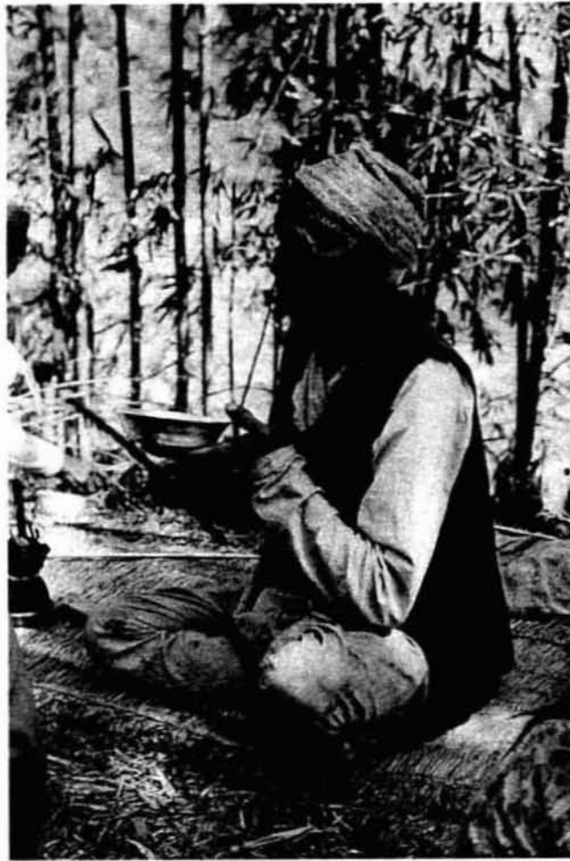
Figure 7.4. The yatangpa plays a plate (like a drum) to help him on his ritual 'journey'.

house construction and all the offerings of beer, ginger, etc. and transporting them into the superhuman realm by means of ritual language.