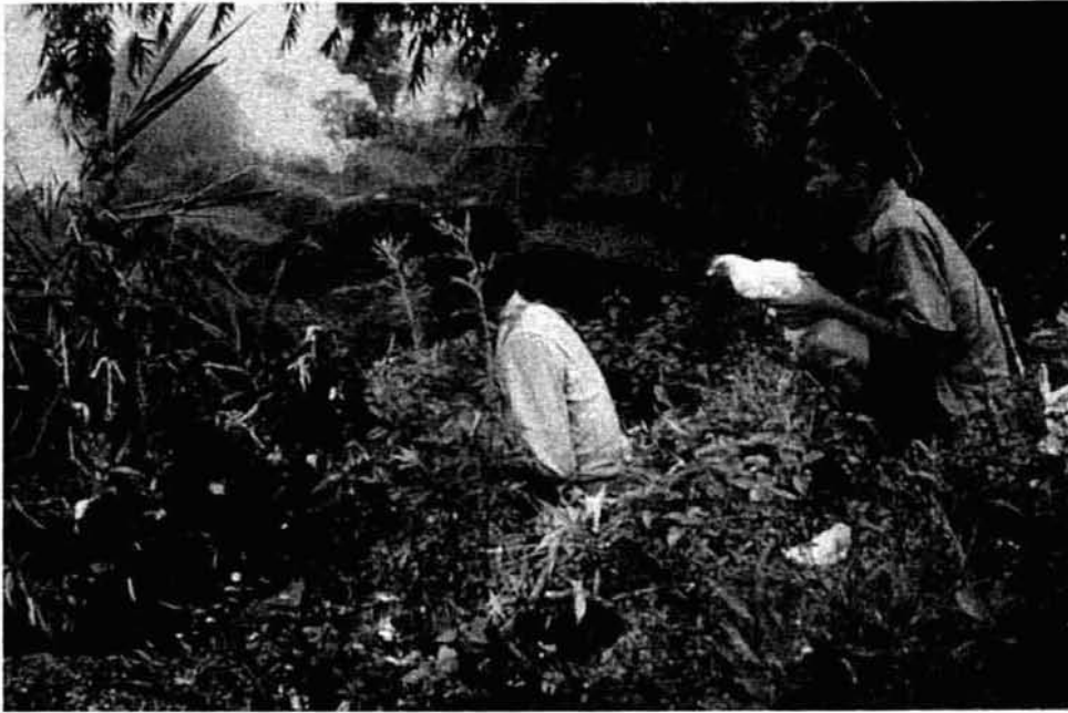
Figure 7.3. A destructible, temporary shrine.

to the nature of personhood. Reflecting this, houses must be built in a particular way and the microcosm of the 'civilised' Lohorung house is found in the house shrine for Khammang and Yimi , made symbolically just as a house is made. These are the ancestors who are guardians of what is spiritually and morally correct and their shrine hangs in a secluded corner of the house, located on the 'uphill' 'front' wall behind and above the hearth, or on the same wall but in the attic. This space is associated with that which is male, the patriline.