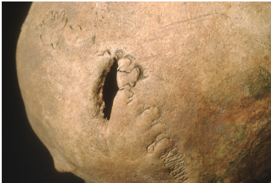
Figure 15 Unhealed (perimortem) injury to the cranium; no evidence of healing