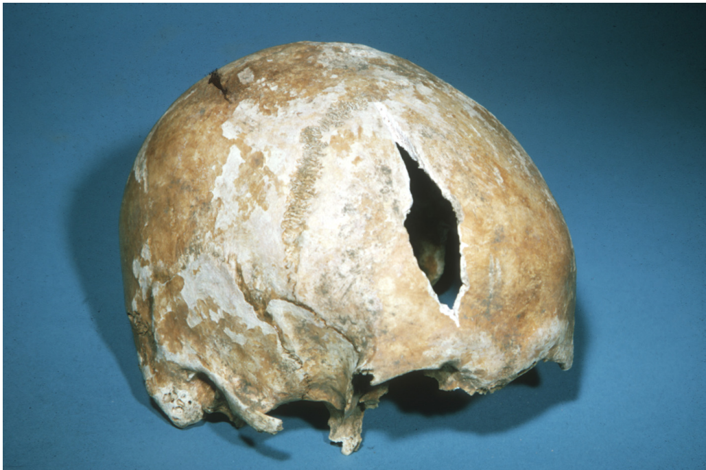
Figure 17 Destructive lesions to the cranium, with some healing and remodeling