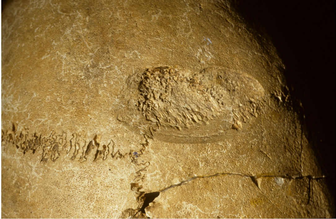
Figure 16 Perimortem “wound” to the cranium; note white edges to the lesion