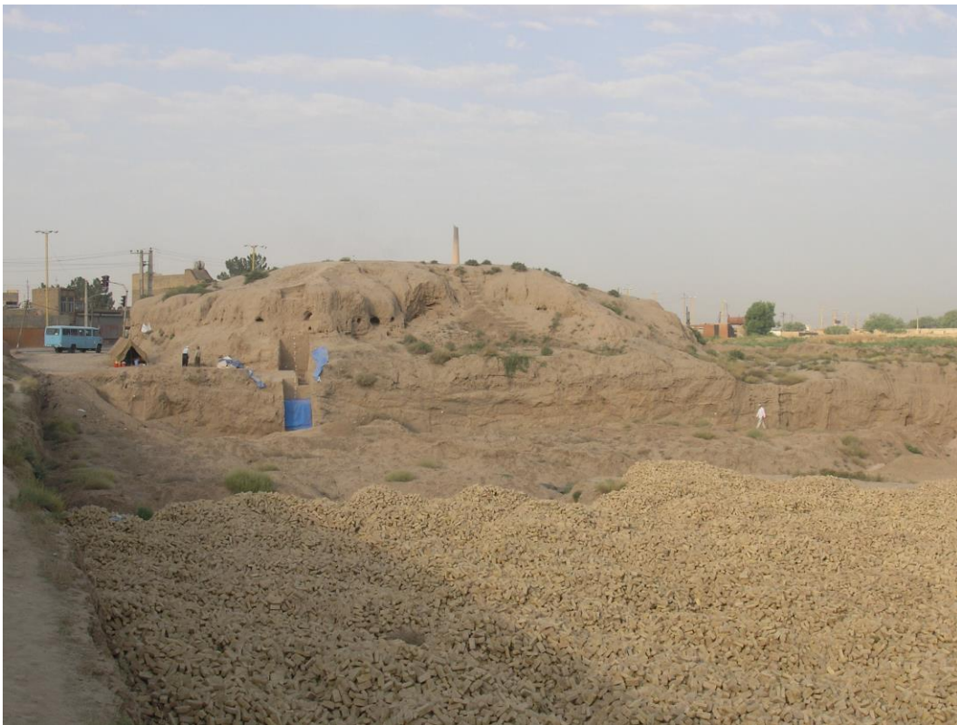
Figure 4. General view of Tepe Pardis showing the modern brick quarry in the foreground, and the step trench excavated into the cut away section of the tell