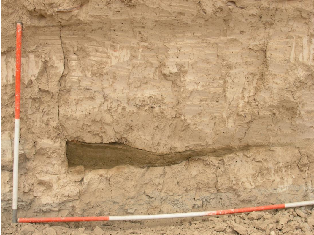
Figure 7. Detailed view of artificial water channel at Tepe Pardis. The triangular profile indicates that it is not naturally occurring