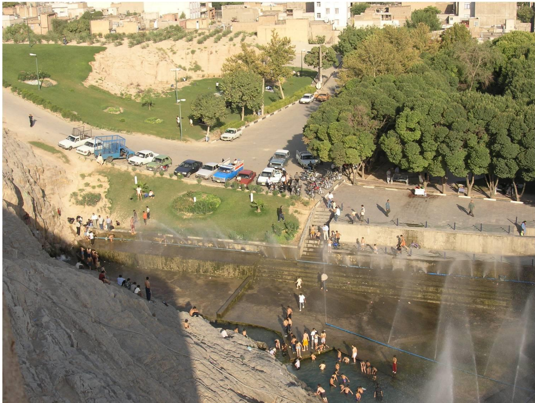
Figure 2. General view of the spring at Cheshmeh Ali, Rey, now a public park