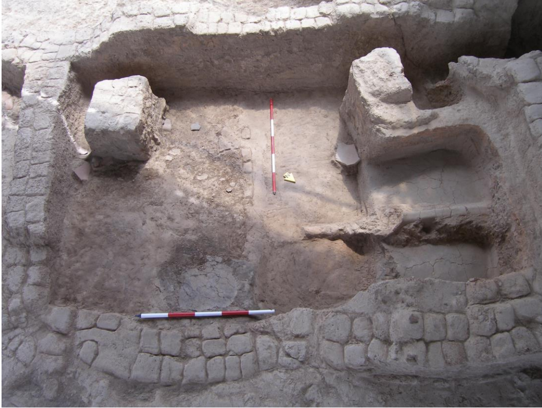
Figure 5. Detailed view of Transitional Chalcolithic kilns at Tepe Pardis. The kiln floors are visible on the right hand side, whilst broken pots are scattered across the floor.