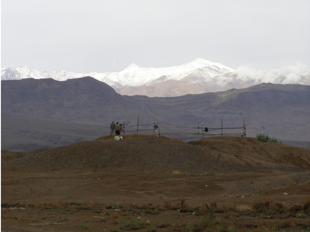
Figure 9. General view of the Karkas Mountains, with the excavations at Sialk in the foreground