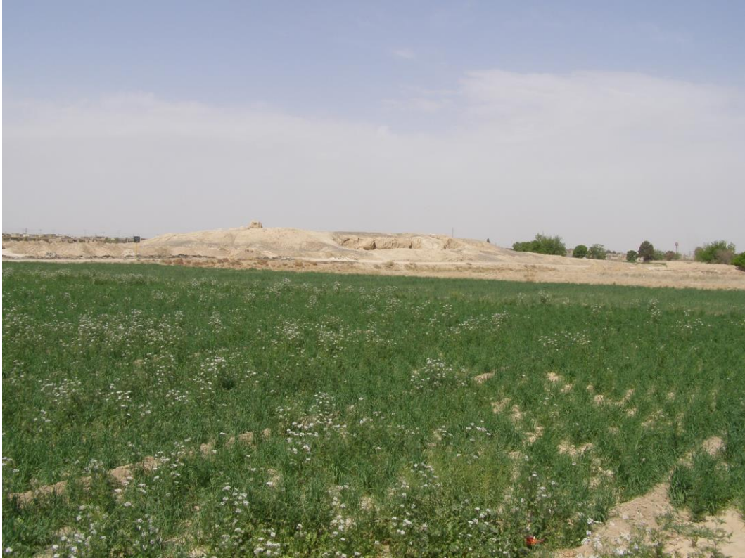
Figure 11. General view of the North Mound of Sialk