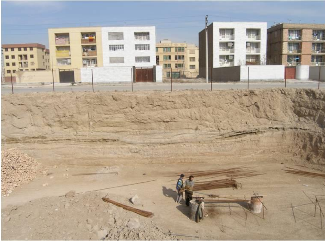
Figure 3. General view of palaeochannels visible in the section of a building site close to Mufinabad