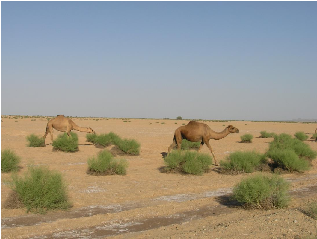
Figure 8. General view of desert to the south of the Tehran Plain