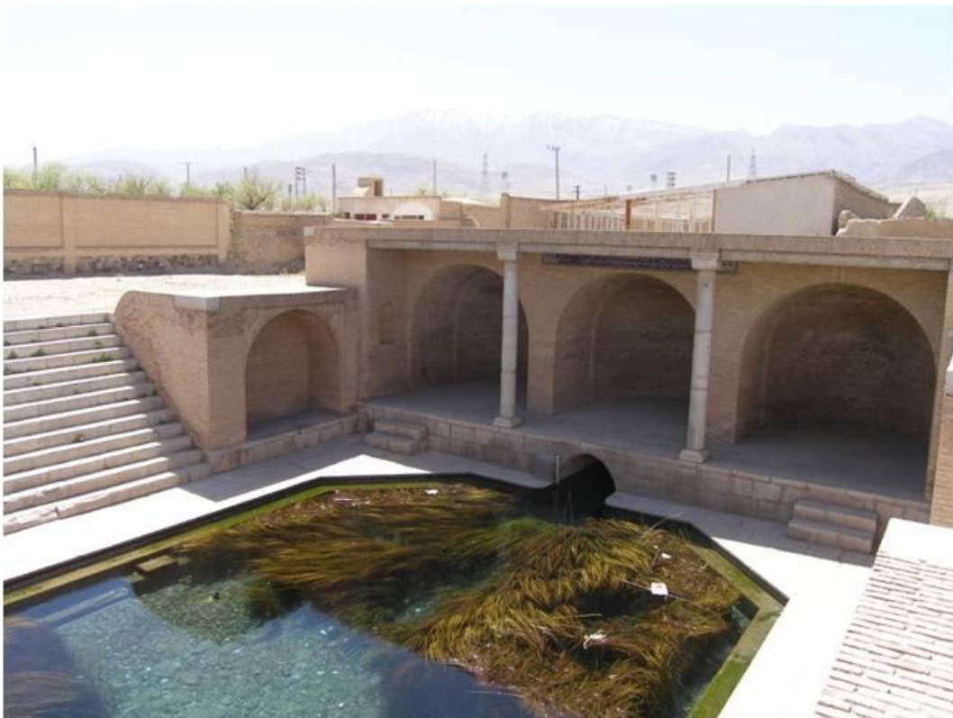
Figure 10. General view of the qanat mouth at Bagh-e-Fin, Kashan. The water supplies the former royal pleasure gardens