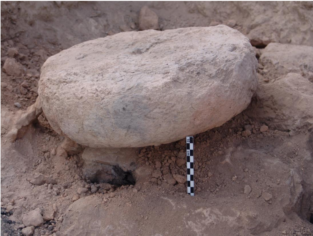
Figure 6. A terracotta slow wheel found at Tepe Pardis, the oldest known example in the world, dating to the fifth millennium BCE