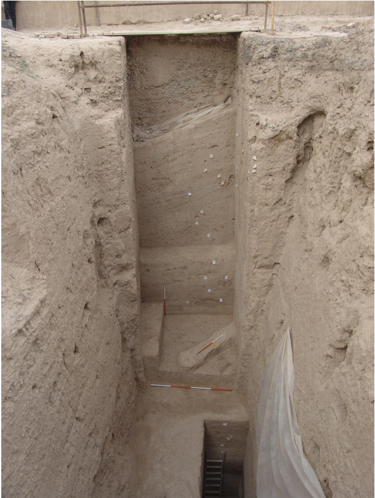
Figure 12. Detailed view of the excavations at the North Mound of Sialk, showing Trench Five cut into the section, and Trench Six cut into the floor of Ghirshman's old trench