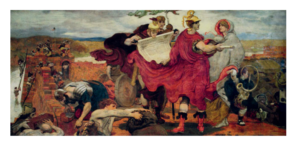
Figure 2: The mural by Ford Madox Brown at Manchester Town Hall entitled 'The Romans Building a Fort at Mancenion, A.D. 80'