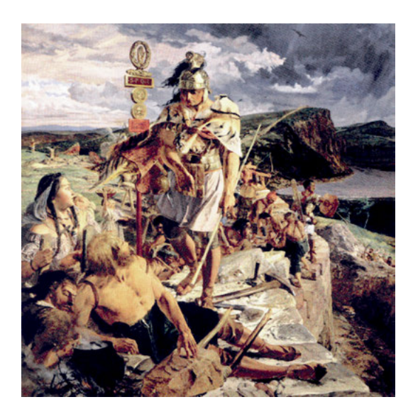
Figure 1: The painting by William Bell Scott at Wellington Hall entitled 'Building of the Roman Wall'