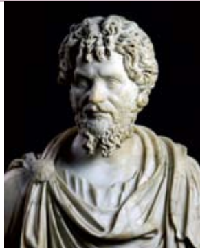
Lucius Septimius Severus emperor AD 193–211