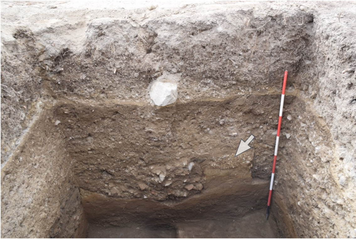
Fig. 6. Area 5, Trench 17, Section looking W. The arrow indicates the residual 1522 landslide deposit, cut by the rubbish pit 17015 on the left.