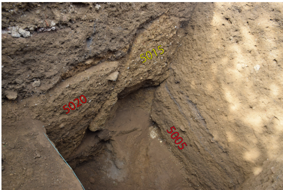
Fig. 4. Area 2, Trench 5. The 1522 landslide deposit (5015) eroded by later water channels filled with gravel and sandy laminar layers (5005, 5020).

the deposit are currently being analysed to assess grain size and composition, to ascertain the bulk characteristics of the flow at different locations and consider the physical impact of the landslide on the settlement of Vila Franca.