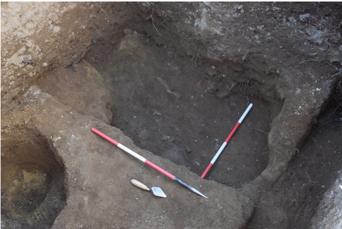
Fig. 7. Area 5, Trench 17. The rubbish pit 17015 under excavation. Note the small furnace 17012 on the left.

Spanish lustrewares made in the Valencia region date to this century and they are both decorated with the briony pattern ( fig. 8b, 8c ). Further imports of the late 15 th -early 16 th century are the Seville wares, including 'cuerda seca' and blue-and-purple dishes. A further sherd from a Montelupo-type maiolica of the early 16 th century. Most of the material, however, are redwares both of local production and also coming from mainland