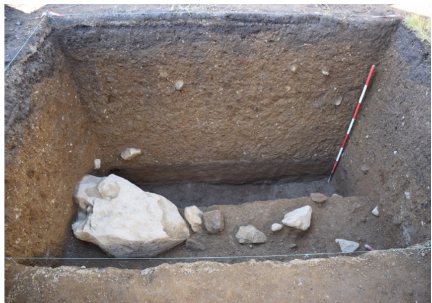
Fig. 2. Area 1, Trench 4. The 1522 landslide deposit with boulders at its base. In the section, the buried soil is clearly visible at the bottom.

differences in grain size and sediment structure arose at each site, and any subsequent modification to the deposit by fluvial action. Observations are targeted at reconstructing the landslide dynamics and impact on the local landscape. There were distinct differences in the deposits logged in trenches in the town centre compared with a vertical exposure of the landslide on the peripheries of the debris fan. In the central areas, the deposit was massive in texture, vertically less