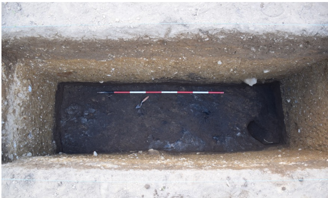
Fig. 5. Area 2, Trench 7. The pre-1522 surface sealed by the landslide. Charcoal and occasional animal bones were found here, suggesting that this area was probably cultivated on the fringes of the town.

The same trench also confirmed that the reoccupation of those areas affected by the landslide was fast ( fig. 6 ); the trench found a metalworking furnace which produced fuel