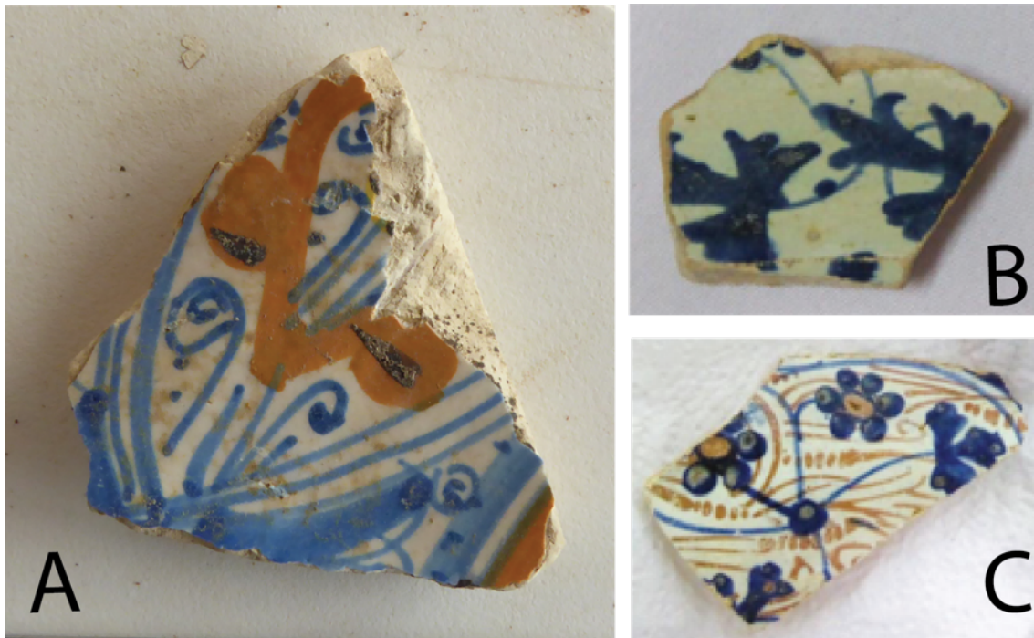
Fig. 8. A: Early 16 th century Italian maiolica from Tuscany, from Trench 17 (context 17015); B, C: Valencian lustreware of the 15 th century from d'Oliveira excavations

Portugal. The collection is an important one and its study would shed new light into Vila Franca's history.