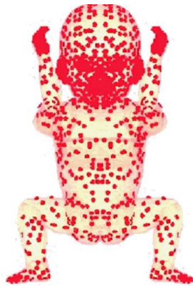
Fig 1. Tactile points of the robotic simulation of sensitivity of the skin developed by Mori & Kuniyoshi (2010).

Yamada et. al. (2016, see Fig.1), tested the intrauterine sensorimotor experiences necessary for learning mechanisms guiding development using a robot model integrating interactions between the brain, body and environment, which they called ‘embodied interactions’. Using this model, they were able to show the mechanistic link between sensorimotor experiences via embodied interactions and the cortical learning of body representation. They demonstrated with their model that intrauterine movements provide specific organisational patterns relating to the body parts based on both proprioception and tactile sensory feedback which resulted in the learning of body representations. This is the basis then on which we can argue that as fetuses move they will learn about their bodies.