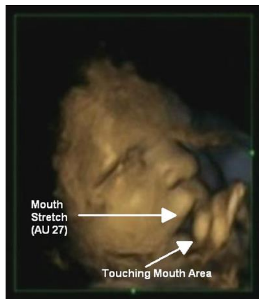
Fig. 4 Fetus touching perioral region of the face

In contrast touches of the lower part of the face increased with age by around 4% for each week of gestational age but the most significant increase was touch of the perioral region of the face with the rate of touch increasing by around 7 % for each week of gestational age (see Fig. 4). Hence, it is suggested that fetuses move their hands and explore the region of the face of prime important for postnatal life such as getting ready to feed from breast or bottle after birth.