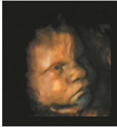
Fig 7. 32 week old fetuses with eyes open

Del Giudice (2011) analysed the amount of light entering the womb. He reports that fetuses will be exposed to ample light for optimal fetal vision of 50 lux intra-uterine illuminance when the mother with an abdominal thickness of 20 mm (measured as the distance between the abdominal surface and the anterior wall of the amniotic sac) stands indoors near a window or outdoors in shadow. Therefore it is likely that during the summer months fetuses can be predicted to develop in conditions allowing for ample visual experience before birth which could result in visually guided touch (see Fig 8.)