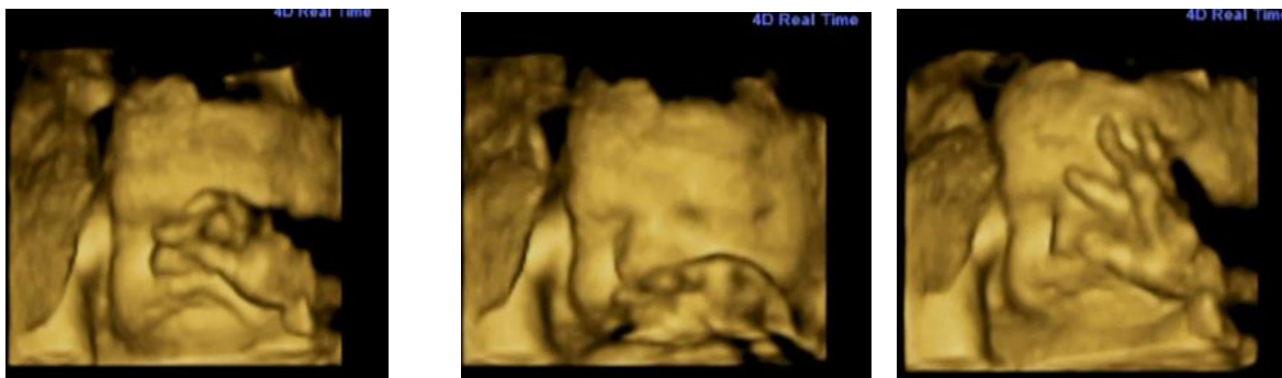
Fig 8. 32 week old fetus raising the left hand towards the eye during exposure to light.

Del Giudice (2011) analysed the amount of light entering the womb. He reports that fetuses will be exposed to ample light for optimal fetal vision of 50 lux intra-uterine illuminance when the mother with an abdominal thickness of 20 mm (measured as the distance between the abdominal surface and the anterior wall of the amniotic sac) stands indoors near a window or outdoors in shadow. Therefore it is likely that during the summer months fetuses can be predicted to develop in conditions allowing for ample visual experience before birth which could result in visually guided touch (see Fig 8.)