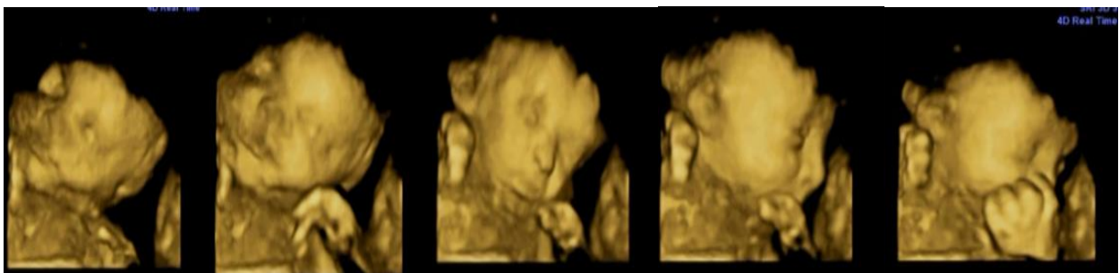
Fig. 5. 32 week old fetus turning the head toward hand and sucking a thumb.