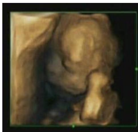
Fig. 3 Fetus touching side of the face.

From 24- 36 weeks of gestation fetuses in this study touched the upper part of their head less as they developed with rate of touch declining by around 9% of each week of gestational age. The rate of decrease of the side of the face (see Fig. 3 as an example of side of the face touch) was around 10% for each week of gestational age.