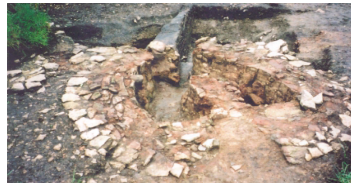
Medieval pottery kiln excavated at Potterspury, Northamptonshire. The database lists archaeological work which has revealed evidence for pottery production, including information on what was found, where it was found, and when the work took place. Organisations and individuals undertaking archaeological work are listed along with the location of resulting archives and associated publications.

The database is now equipped with an 'easy-to-use' front end complete with a selection of regularly used data queries and a help file, and is available on CD. The CDs are free of charge to all who originally supplied information to the project,