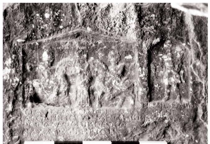
Aurelia Nenas' relief