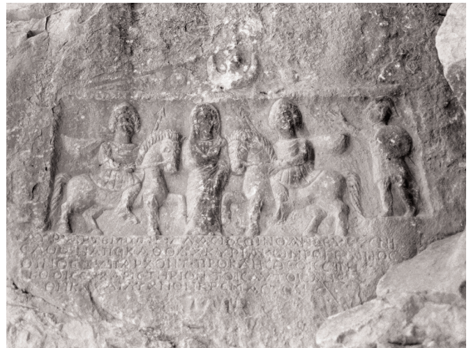
Aurelius Artemon's relief

The İntaşı Cave, where Artemon and Nenas had their dedications carved onto the walls and where there are four such reliefs in total, was in use for millennia, as shown by prehistoric materials found at the cave mouth. It may have