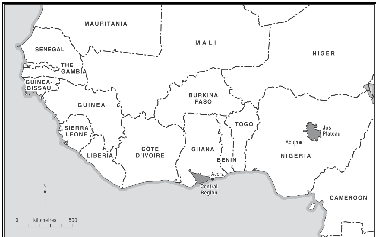
Figure 1: Map of West Africa, showing locations of Jos Plateau in Nigeria and Central Region in Ghana

powerlessness frequently experienced by off-road residents, even in settlements located just a few miles from the paved road. A fuller discussion of the issues is available in Porter (2002).