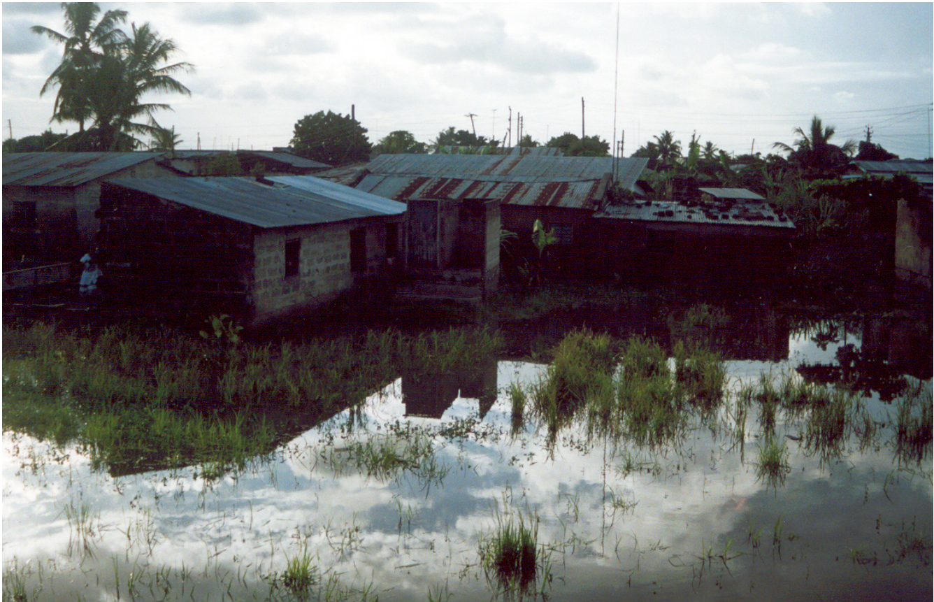
Figure 6 Examples of flooded areas in the poorly planned settlements of Vingunguti in Ilala municipality, Dar es Salaam, Tanzania.

ideal for delivering community-based vector control interventions [15,34,39,87]. This degree of autonomy enabled Ilala Municipal Council to independently conceive, fund and implement a community-based mosquito surveillance programme as an entirely local initiative in early 2002. Supplementing ongoing programmes for social marketing of ITNs and improved access to effective diagnosis and treatment [88], teams of community members were recruited to map and characterize the extensive breeding sites provided by intensive urban agriculture and poorly planned settlement (Figure 6) which abound in Dar es Salaam [76,89] and many other African cities [19,20,90-93]. Weekly surveys for larval and adult mosquitoes were piloted in 7 of the 22 wards of Ilala Municipality as a preliminary step towards IVM by larviciding and environmental management. Furthermore, all three municipal councils had actively promoted a variety of locality-specific community-based environmental management schemes such as trench digging and collection of solid waste refuse to prevent obstruction of such drains (Figure 7). In June 2003 the City Medical Office of Health (CMOH) convened a stakeholders meeting for all con-