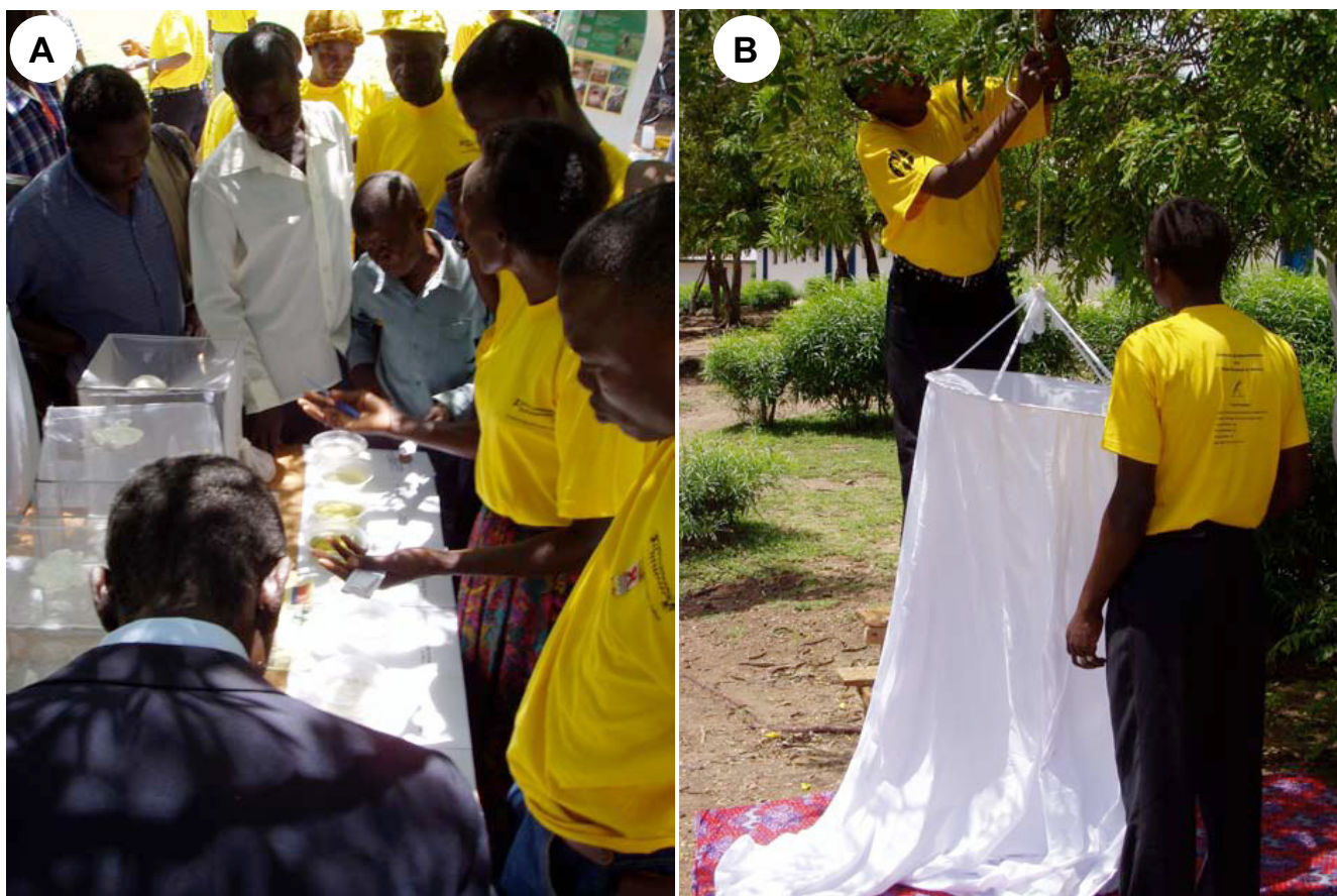
Figure 2 Community members demonstrate the life cycle of mosquitoes (A) and the use of practicable adult mosquito sampling tools (B) at Rusinga Island Child and Family Programme/Christian Children's Fund-Kenya, African Malaria Day, May 2004 on Rusinga Island, Western Kenya.

sustainable changes in behaviour with knowledge transfer from children to adults and between families and friends.