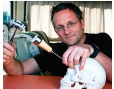
Mosley: cheerful, and spares himself not at all

"Spare Parts" deals with transplant surgery, starting with teeth in the 18th century (rejected after a couple of months), then the pioneer work of Alexis Carrell, who solved the technical problems of organ transplantation in the early 20th century but was defeated by the biology of