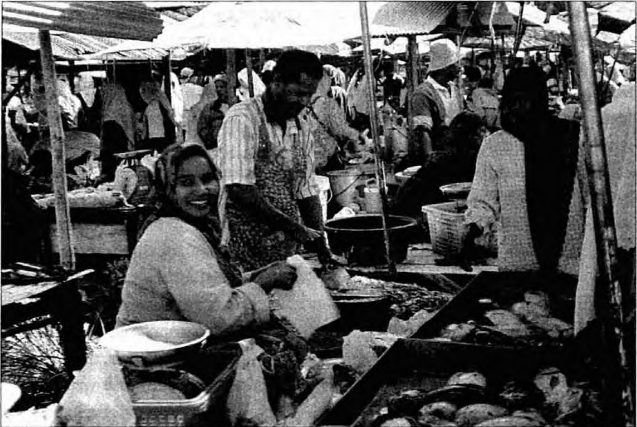
Weekly market in Khuan Don District, fish from farm.