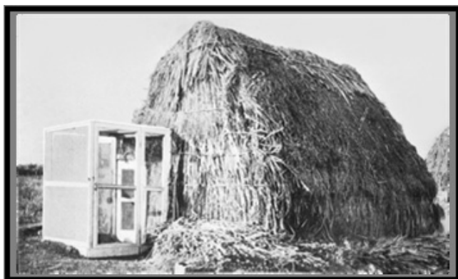
Figure 1 A screened entrance to a thatched house in rural Italy in 1900, in an experiment where screening reduced malaria by 96% [20]. This illustrates that even extremely poor housing can be protected from mosquitoes.

The literature review of Lindsay et al. provides compelling evidence that house screening has been associated with protection against malaria transmission, infection and morbidity[12]. Furthermore, a pilot study conducted in The Gambia using experimental huts demonstrated that netting ceilings alone can reduce exposure to malaria vectors by 80%[13]. In this situation, most mosquitoes entered the huts through the open eaves and were effectively trapped in the roof space. Further studies in actual village houses are needed to confirm these findings and to assess the acceptability of the intervention to house-holders.