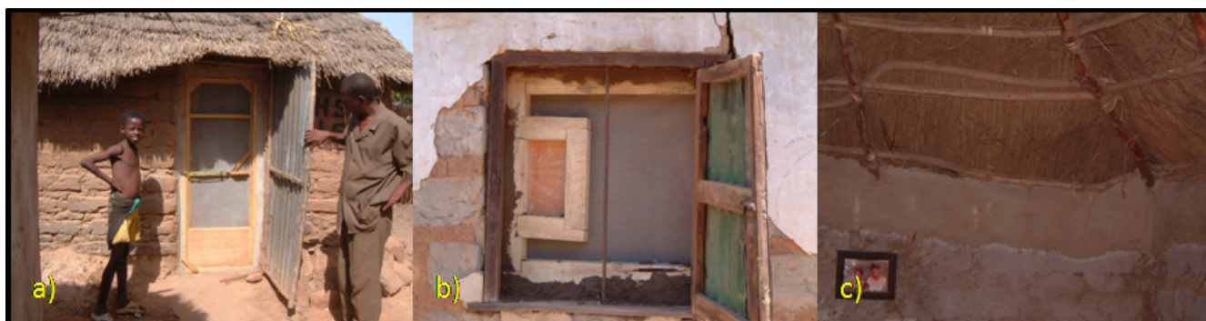
Figure 2 Installation of full screening intervention: a) screened door, b) screened window, c) closed eaves.

Sheets of 2.4 m wide white PVC-coated fibreglass netting (Vestergaard Frandsen group, Denmark) will be cut to fit the room (leaving at least 50 cm overhang on all sides),