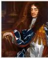
Charles II (reigned 1660-85)

1540s, finding the new Dispensation still too Catholic for their tastes. The Lollards were more often called Anabaptists or Familist by the seventeenth century, and remained a primarily northern tendency. 6 George Fox, the leading Quaker, speaks of meeting groups of ‘Seekers’ and ‘Shattered Baptists’ during his first sorties into the North. 7 The faith and practice of these groups already contained the seed of what would become known as Quakerism. 8 Quakerism provided a final resting place for many of those who were already involved in radicals, including Gerard Winstanley (Digger) and John Lilburne (Leveller).