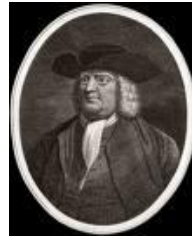
William Penn (1644-1718) prominent English Quaker