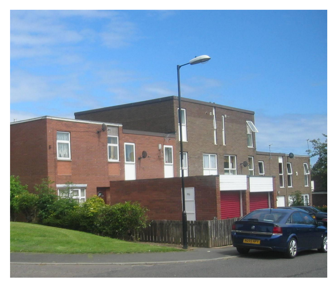
Fig 3 Social housing, Washington, also designed around the needs of the car