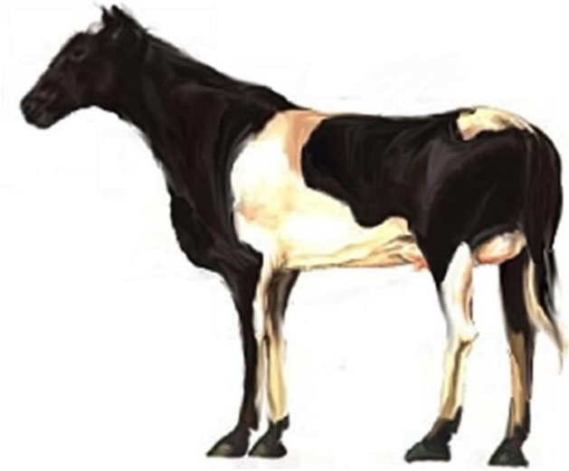
Figure 1. Examples of 50-50 Hybrids (Cow-Horse and Bear-Pig)