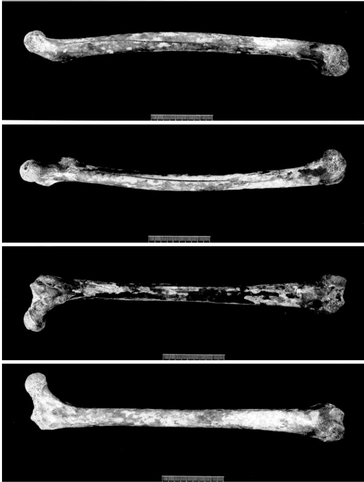
Figure 2: The Theropithecus cf. darti right femur