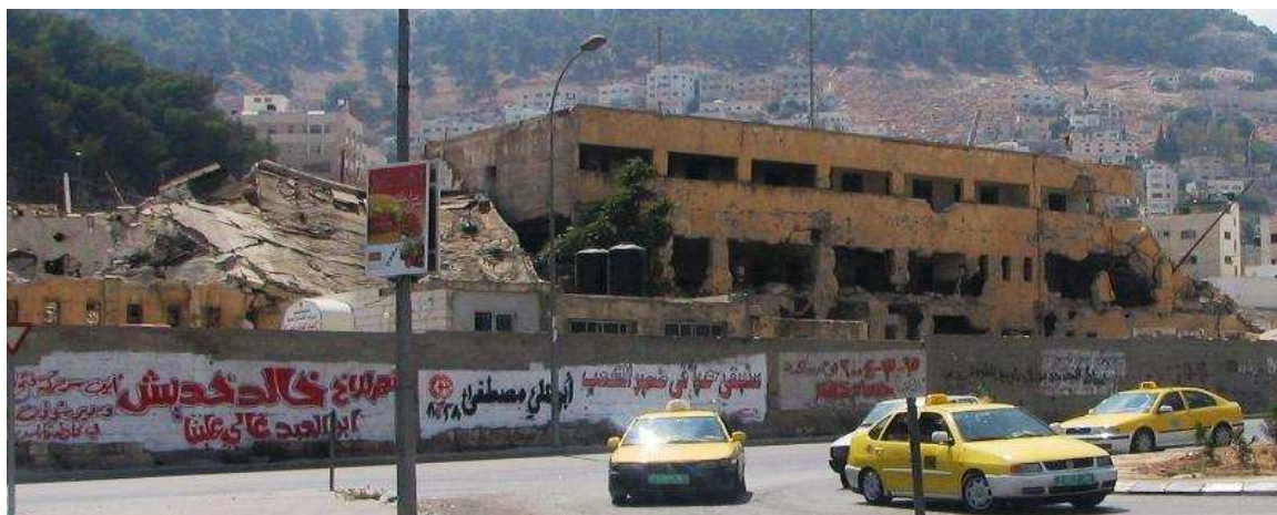
Figure 3: The muqata' following its complete destruction in the summer of 2006.

This return to direct sovereign violence is best illustrated by the final picture in this triptych of destruction: a completely gutted muqata' building, torn apart by tanks and bulldozers in the summer of 2006 (as Israel was simultaneously attacking Lebanon and Gaza). Not content with allowing alleged terrorists to sit in a Palestinian jail, Israeli forces leveled the entire complex, killing three prisoners and a staff nurse, and blowing up a large civic archive maintained by the Department of Interior, scattering to the wind birth registries, land deeds and other historical documents dating back to the mandate period, as well as recent passport applications and birth certificates. The destruction represents a complete suspension of the law, both the disciplinary legal authority that the Israelis had outsourced to the Palestinian during the Oslo years, and the biopolitical, bureaucratic governmental authority represented by the birth and death registries. 12