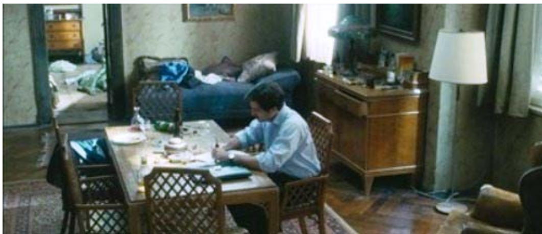
Figure 1. Writing to Defferre