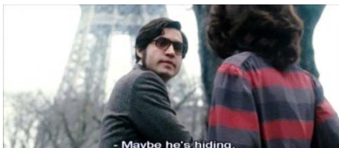
Figure 9. Tension before rue Toullier

After rue Toullier, the multiple homicides that gave Carlos his first taste of media infamy and condemned him to a life on-the-run, Assayas takes us to the Air France bus terminal in Les Invalides. Here,