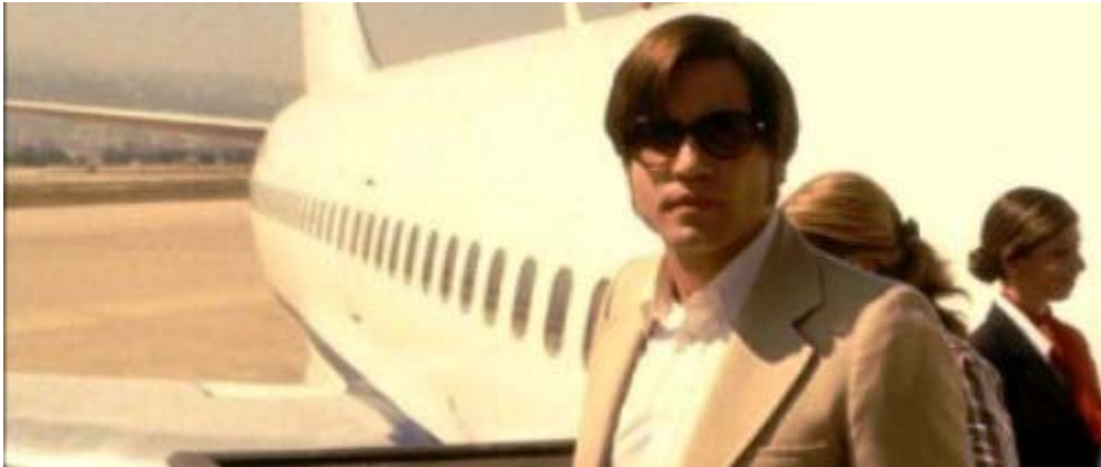
Figure 7. Beirut Airport