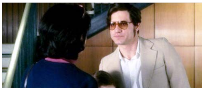
Figure 10. After the murders

Lest we be tempted into over-identifying with the Jackal’s strange attraction (especially as the casting of Ramírez rather flatters the real Carlos), here we are reminded that the photograph is live and dangerous (Fig. 10).