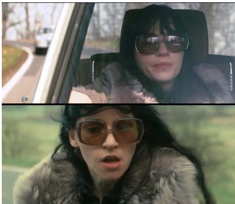
Figure 11. 'Don't need no pretty face'; Fig. 12. Nada is captured