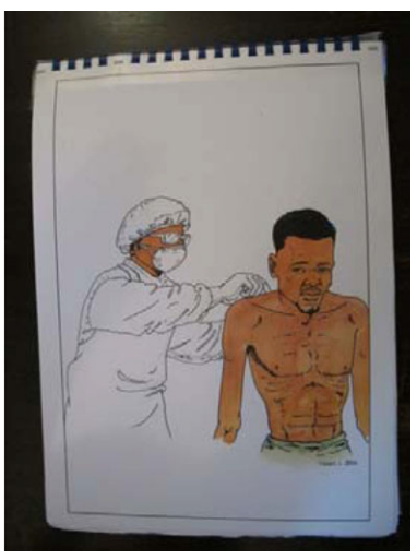
Figure 1. Images from a visual aid used in a public health campaign in DRC compare dangerous with protected caregiving of a patient with Ebola (LNSP/MSASF and France Cooperation N. d.).

of hunting) and developing strategies to curtail outbreaks through quarantine (see Figure 1).