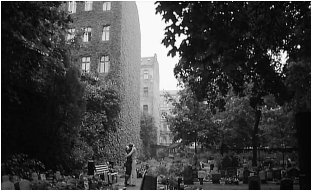
Figure 3: The court-graveyard in Solo Sunny

Such visualisations of obsolescence and decay are examples of a subjective urban memorial gaze that identifies the (passage of) time within the built environment. When juxtaposed with the new, that obsolescence haunts the products of the synchronic urban gaze, offering by extension a critique of the ostensible quantifiability of the cityscape and the ideological denunciation of obsolescence.