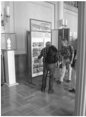
Figure 6: 'Die gerettete Mitte' board at the exhibition (with visitors): Photograph: Simon Ward

The rest of the boards were titled thematically, and comprised a compendium of the important aspects of contemporary urban renewal, from a reflective and meticulous planning culture to a documentation of the history of the district.