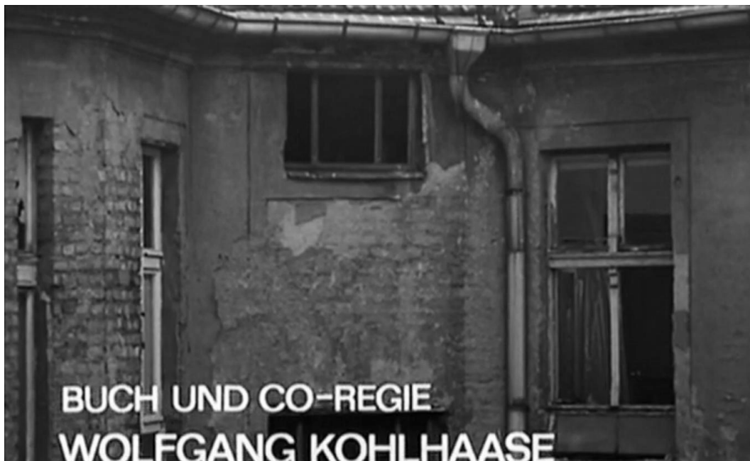
Fig 1. Opening courtyard façade in Solo Sunny

structures, but also critiques the celebration of automobility. 42 Solo Sunny is very aware of the codes which shape its forebear's semiotic structure: the name of a former inhabitant's girlfriend, 'Rita', inscribed within a heart on a door in Ralph's room is a direct citation of the Paul/a inscribed within a heart on Paula's door in the earlier film; the film also uses an apparently serendipitous shot of demolition, which nevertheless knowingly refers back to the staged demolitions of the earlier film. Nevertheless, Solo Sunny refuses to sentimentalise the old apartment block, which is shown to be a place of petty jealousies, suspicions and an upwardly mobile bohemian set. The film is also more ambiguous in its presentation of the relationship between the obsolete and the modern. Although the camera frequently lingers on decaying façades in front of which Sunny walks, it seldom directly juxtaposes this with a vision of the new. This ambiguity is derived from its more subtle exploration of the cinematic gaze as a way of framing the built environment.