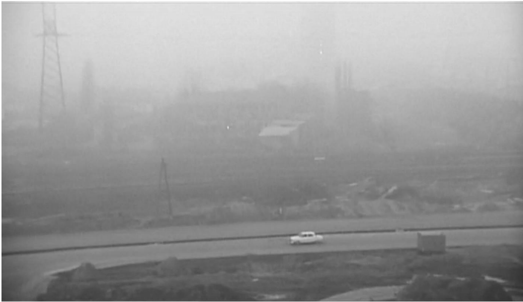
Fig 2. Sunny's gaze upon the empty cityscape in Solo Sunny

Like Paula, Sunny is also offered a way out of her situation by a man with a car, in this case it is Harry, a taxi driver. Her alternative (in more than one sense) is Ralph, who describes himself at one point as 'not living in a new apartment block, not having a registered car nor a television', and whom the mise-en-scène associates with the decaying back courtyards of the former 'Mietskasernen'; a key scene locates Sunny and Ralph in a graveyard framed within a courtyard covered in ivy. Ralph is writing about 'death and society', addressing the question of decay which the GDR society with its synchronic gaze was refusing to address.