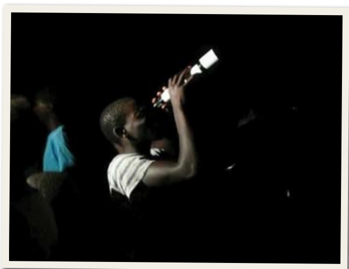
7: Trying out a telescope at Roça Sundry.