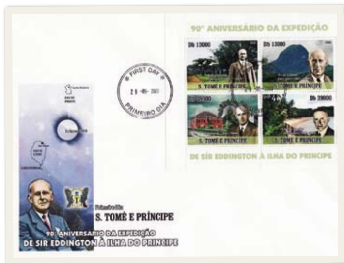
6: A new issue of stamps celebrate Príncipe's place in astronomical history.