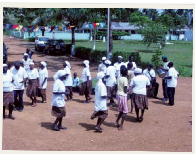
5: Music and dancing in Sundry: the dëxa group.

But it does create a gravitational field and can thus be revealed by gravitational lensing. In the same way that lines of text can become bent when read through a magnifying glass, images of distant galaxies can appear grossly distorted and magnified when behind a concentration of dark matter. It is possible to work out the shape and material properties of a magnifying glass from distorted images of text, even though the glass is transparent. Using the same technique to investigate dark matter, astronomy is currently leading particle physics in what may turn out to be the most important scientific investigation of the 21st century.