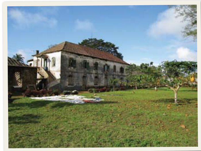
1: The old plantation buildings at Roça Sundry, Eddington's base in 1919.

At the time of Eddington's expedition, Príncipe formed part of Portuguese colonial territory, and correspondence recently unearthed at the Geographical Society of Lisbon reveals that the RAS had already begun asking for maps and permission to visit the island during the war. The eclipse would be visible across South