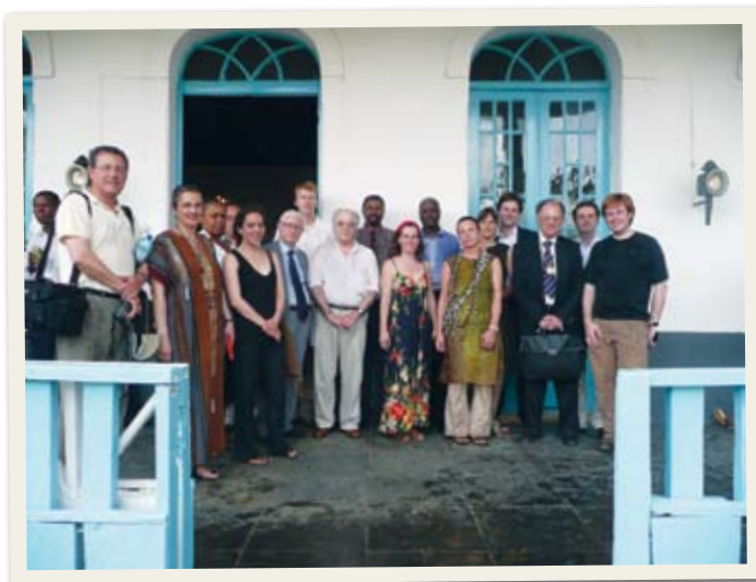
4: The team from Britain, São Tomé e Príncipe, Portugal and Brazil.