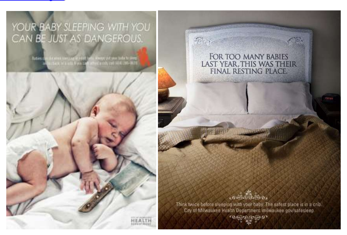
Figure 3. Images from the Milwaukee campaign against SIDS.

<sup>38</sup> Ball HL, Volpe LE. Sudden Infant Death Syndrome (SIDS) risk reduction and infant sleep location - Moving the discussion forward. Soc Sci Med 2012; doi:10.1016/j.socscimed.2012.03.025