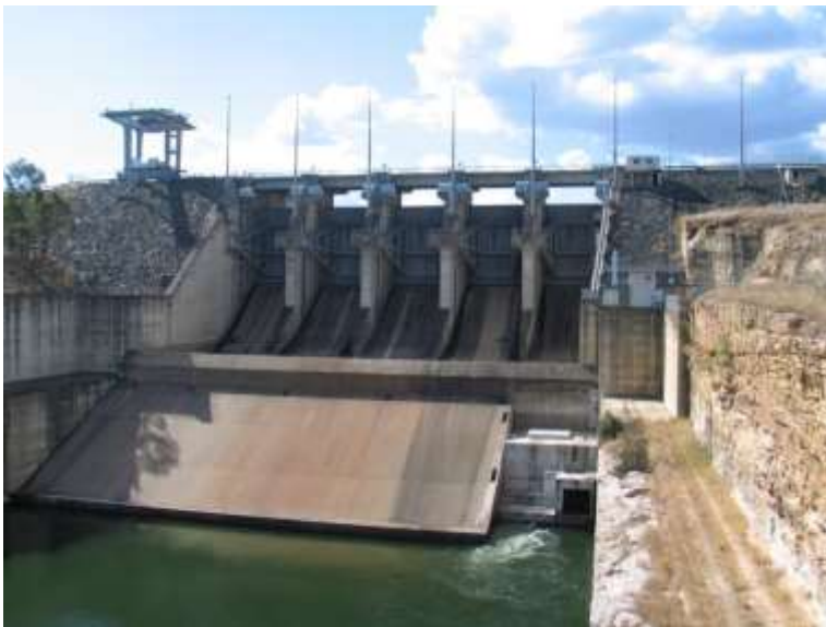
Fig. 6. Wivenhoe Dam, south-east Queensland.

Hill's account describes the 'Miracle of the Murray'; the 'Apostles of Irrigation' and a vision of 'Utopia on the Murray.' There are biblical 'Years of the Locust'; 'Gentle Rain from Heaven' and sometimes punitive 'Acts of God'. But, as McColl's reported willingness to 'question the divine Creator's plan' attests, this was not just an assertion of monotheistic authority: it was equally an instrumental vision of human (male) agency, in which 'the environment' was an object of material subordination.