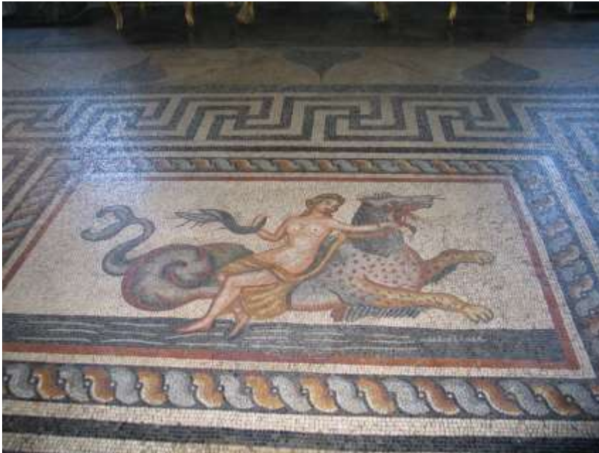
Fig. 3. A mosaic in ancient Rhodes suggests the co-existence of non-human and humanised deities.

hegemony served to export these ideas and material culture: thus conquered Celtic tribes in Britain, such as the ‘water dwelling’ Durotriges in Dorset, found themselves enslaved on the treadmills of Roman water wheels, while their local water beings were renamed for goddesses in a Roman pantheon inhabited, like that of the Greeks, with increasingly humanised deities.