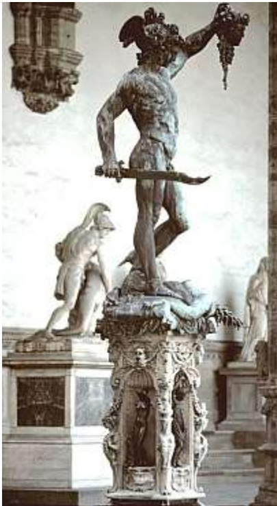
Fig. 4. Benvenuto Cellini's sculpture of Perseus standing on the slain body of Medusa, Florence.

appropriated the feminine powers of the oracle at Delphi. 46 Hercules did away with the many-headed Lernean Hydra. 47 In Scandinavia, Beowulf triumphed over the female serpent mother of Grendel, a ‘banished monster’, and an ‘adversary of God’. 48 Cosmologies therefore became heavily populated by male warrior beings whose role, it seemed, was to triumph over the feminine elements, over other societies, and – eventually – over all other gods.