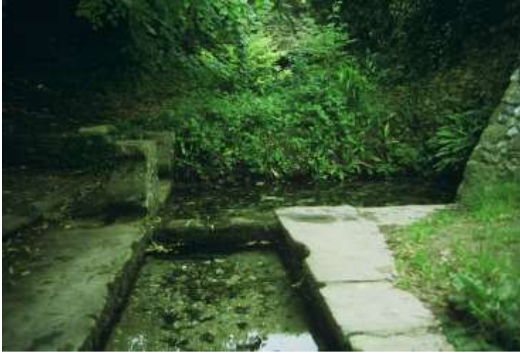
Fig. 5. A holy well in Dorset, renamed for St Augustine, lies just below the potent figure of the pre-Christian chalk giant at Cerne Abbas.