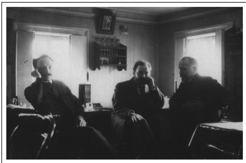
Figure 3. A. P. Nechaev, A. F. Lazurskii and G. I. Rossolimo (1911); NA RAO f. 86, d. 46.

mental profiles. In early-20th-century Russia, test-packages of this kind were referred to as ‘methods’ [ metody ] and usually bore the name of their creator. The internationally famous Binet-Simon ‘method’ was the one most used and discussed in Russia, although there were a number of others. It was recognized from the start, though, that foreign tests posed the significant problem of adaptation to Russian social and cultural conditions. Indeed, it seemed rather scandalous when, in the early years, some results of research carried out using the Binet-Simon test appeared to indicate that the mental age of Russian children was on average two years lower than that of their French counterparts (Chelpanov, 1912b: 182; Sokolov, 1956b: 25). While some researchers (notably A. M. Shubert, who initially worked together with Bernshtein) devoted much of their energies to adapting foreign tests (Shubert, 1912, 1913), a number of Russian psychologists and psychiatrists preferred to develop and market original ‘methods’ of their own.