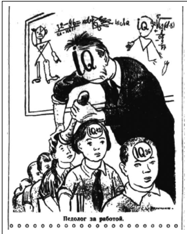
Figure 1. 'The paedologist at work' (by Kukriniksy), Pravda , 31 August 1936.

courses, a spate of vitriolic denunciations in the press, and the forcing of a number of high-profile former 'paedologists' into public declarations of repentant self-criticism, with many being subjected to further repressive measures (Kurek, 2004). In the campaign to stigmatize paedology as a 'pseudo-science', the mental test was singled out as the paedologists' trademark tool – an instrument that had, in this context, inflicted the greatest harm on the Soviet working class and its revolutionary cause (Figure 1). From 1936 onwards all forms of 'testing' were officially banned from Soviet research and education, and remained so until the collapse of the regime in 1991 (Kadnevskii, 2004).