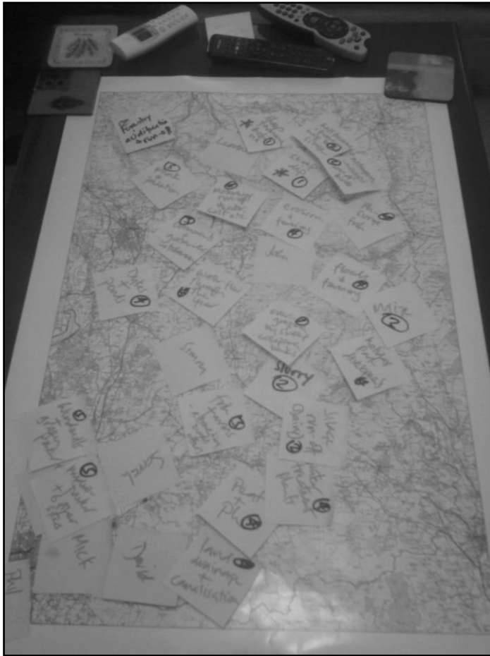
Figure 1: Participatory diagramming of key issues in the Lune River catchment

The precise research question was not generated until the fifth group meeting. First, the group (academics and LRT members) conducted background research on slurry, to understand the nature of the problem experienced in the Lune catchment. By discussing this research the group came to a consensus on the role of slurry in reducing instream oxygen concentrations and its impact on the river as a whole. Here group members brought their own concerns to bear, especially the impact of bad weather and the Trust's experience of government policy: