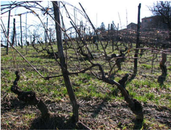
Figure 2 Vine before pruning

http://commons.wikimedia.org/wiki/File:Guyot_1.svg